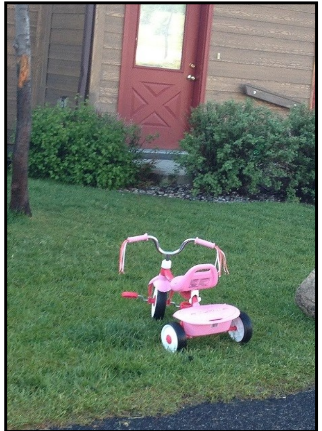
No parking on the grass!

The board is continuously working to find a solution and has given HPM the directive to focus their efforts on the blatant violations such as parking in the grass, double parking, and parking in the street. Please be advised that vehicles in violation are subject to tow.