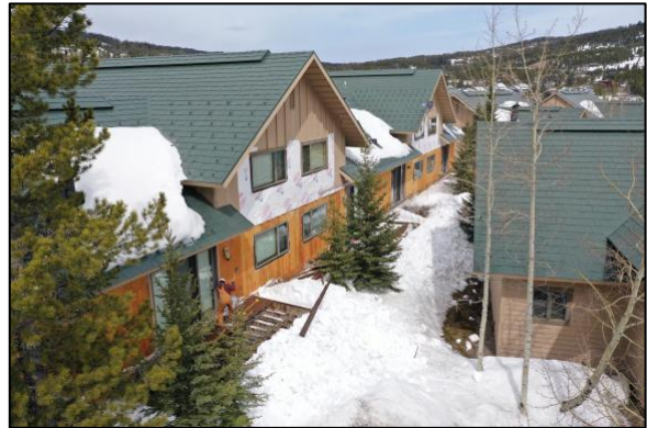
Bldg E3 Unit #27 Decking Removal