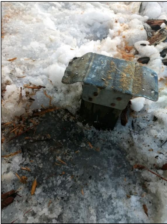
Units #25, 26 Deck Supports