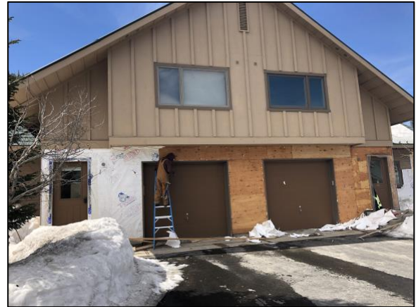
Bldg E1 North Side Siding Removal