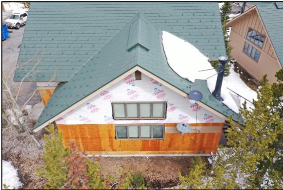
Bldg E3 Unit #27 Looking West