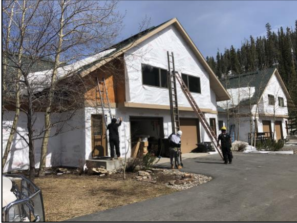
Bldg E3 Tyvek in Progress South Side