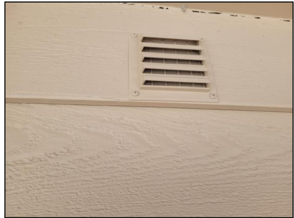
Unit #11 Vent Exterior