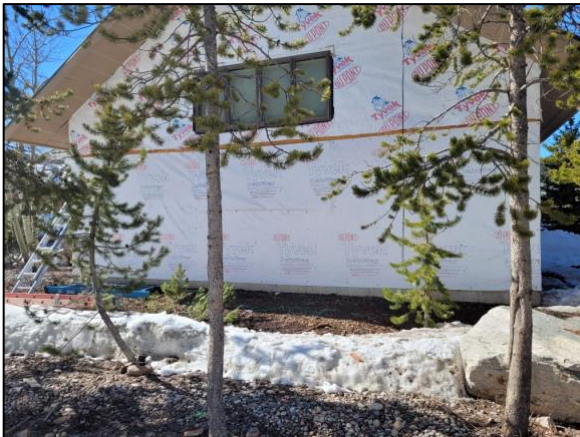
Bldg E3 Tyvek in Progress East Side