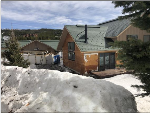
Bldg E1 West Side Siding Removal