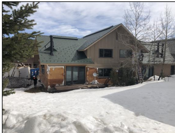
Bldg E1 South Side Siding Removal