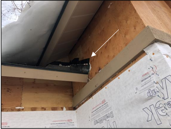
Units #24, 25, 26 Existing Diverter in Place