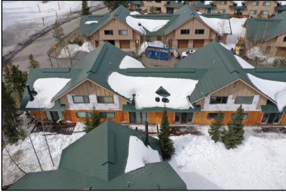
Bldg E3 South Side