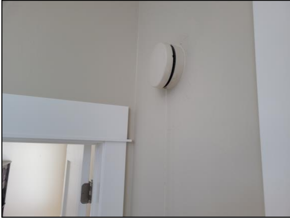
Unit #11 Vent