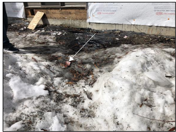
Unit #24 Deck Support