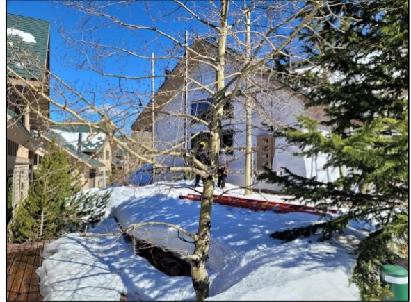
Bldg E3 Tyvek in Progress West Side