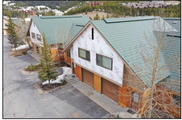
Bldg E3 Looking West