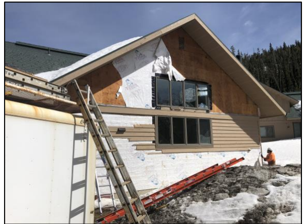
Bldg E1 Siding Removal in Progress