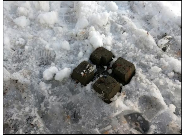
Unit #27 Deck Masonry Pier