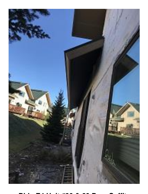
Bldg E4 Unit #30 & 29 Rear Soffit