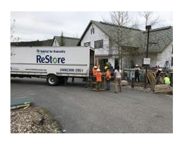
Habitat for Humanity Donation of Removed Windows