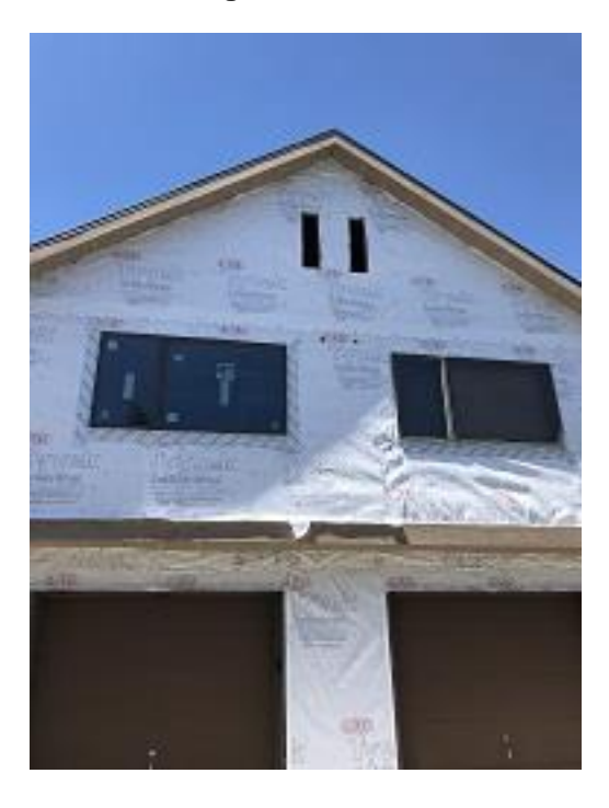
Bldg E2 Unit #20 & 21 Gable Vents