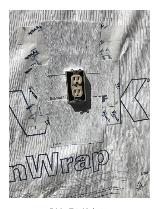
Bldg E4 Unit 28