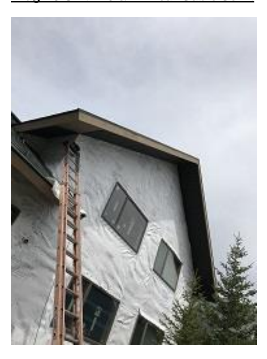
Bldg E3 Unit #24 & 25 Gable Soffit