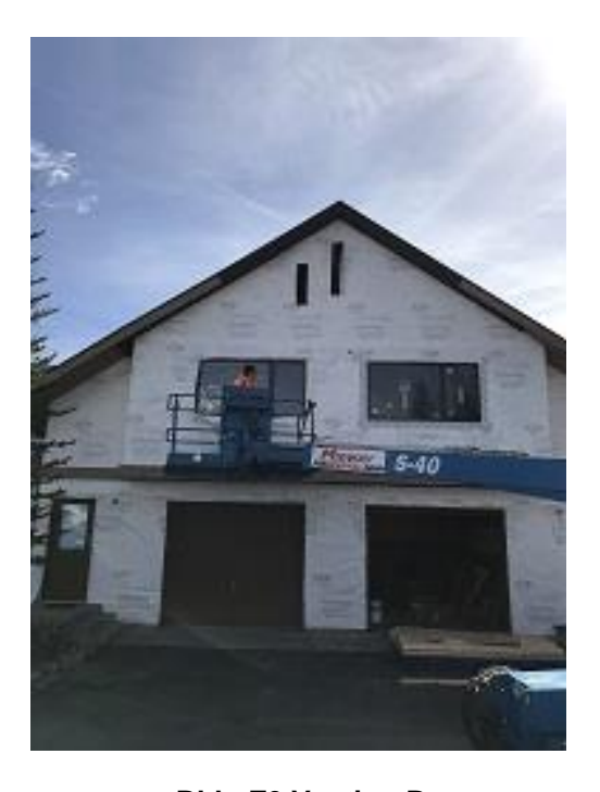
Bldg E3 Venting B