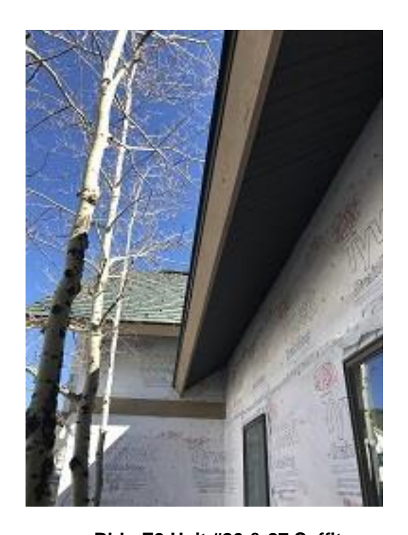
Bldg E3 Unit #26 & 27 Soffit