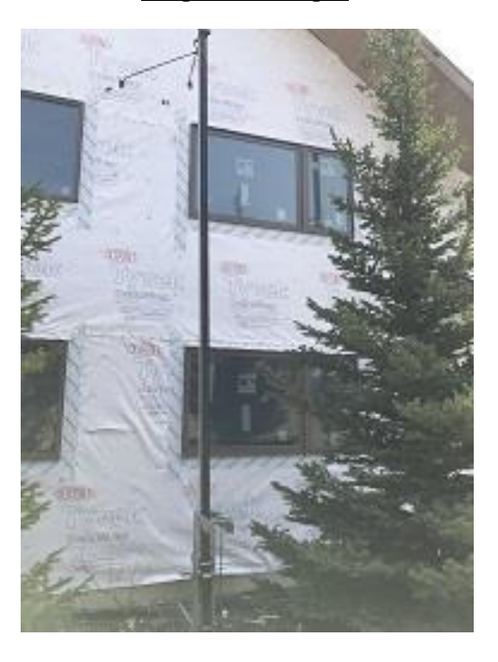
Bldg E4 Unit #29 Upper & Lower Windows