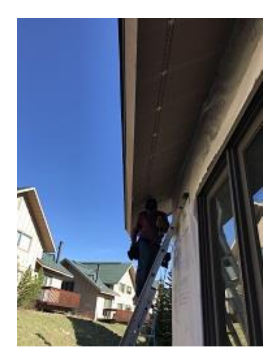
Bldg E3 Unit #28 Rear Cutouts Soffit Vents