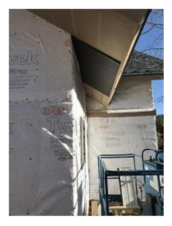
Bldg E2 Unit #23 Front Soffit