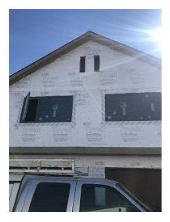
Bldg E3 Unit #24 & 25 Gable Vents