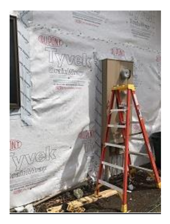
Bldg E2 Electrical Panel Flashing Tape