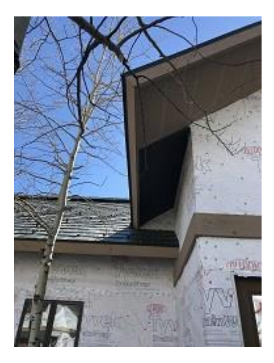
Bldg E3 Unit #26 Soffit