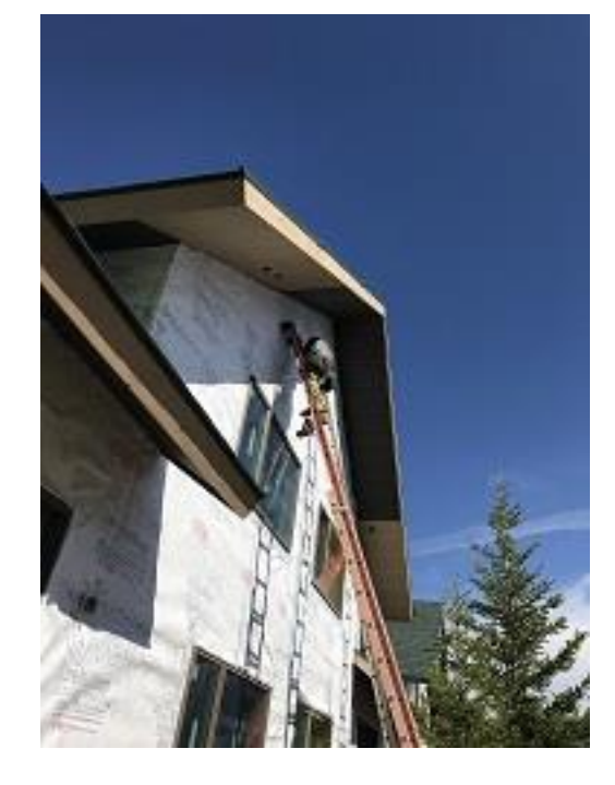
Bldg E3 Unit #26 & 27 Rear Gable Soffit