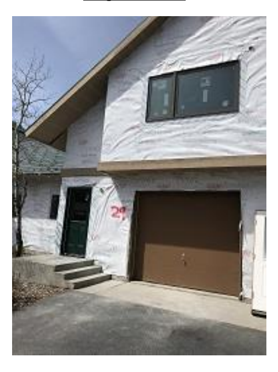
Bldg E4 Unit #29 Above Garage