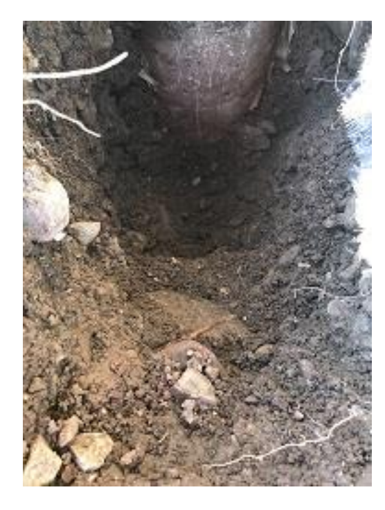
Bldg E5 Unit #44 Deck Pier Foundation