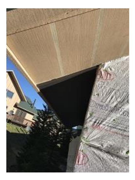
Bldg E4 Unit #31 Rear Soffit