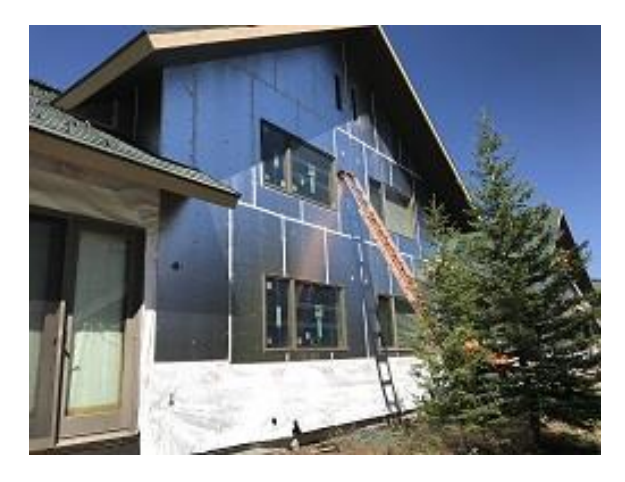
Building E3 Unit 26 & 27 Cut In Vents