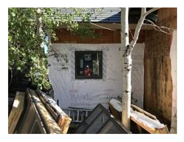
Building F1 Unit 17 Kitchen Window Installed