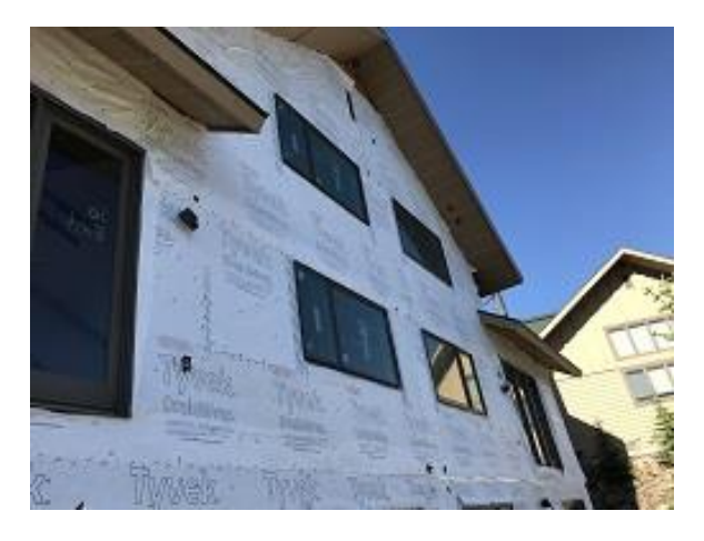
Building F1 Unit 17 Rear Upper Window Installed