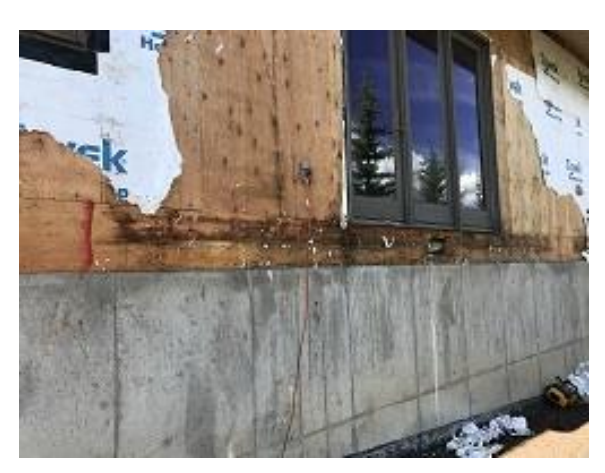
Building E7 Unit 50 Deck Pier Blocking Area Defined