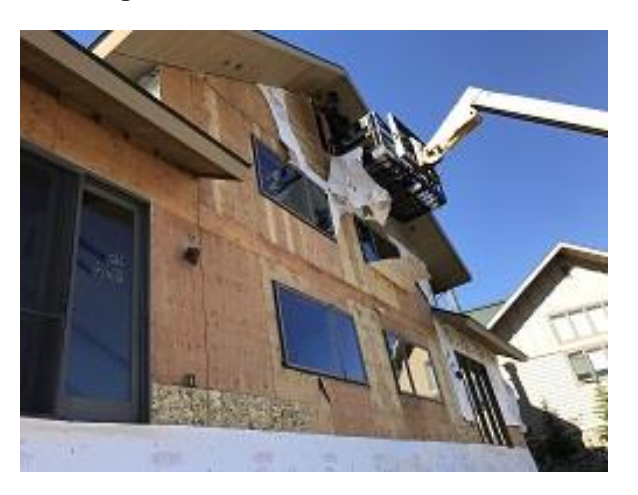
Building F1 Unit 16 & 17 Demo Continued