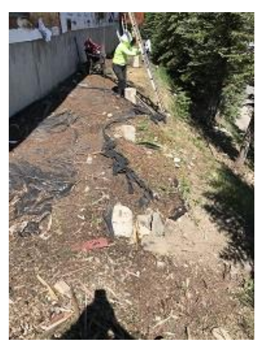
Building E7 Unit 49 Deck Pier Bracket Removed