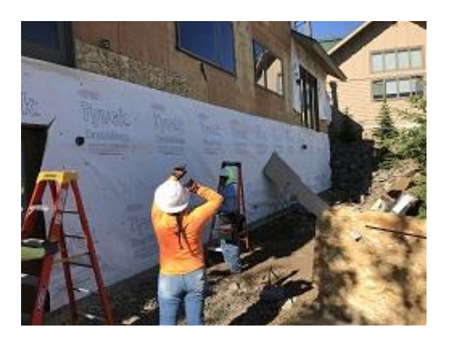
Bldg F1 Unit 16 & 17 Tyvek Install Continued