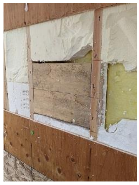
Building F1 Unit 16 Upper Deck Railing Blocking