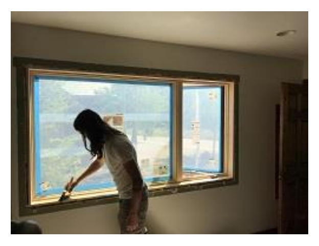
Building E3 Unit 27 Lower Back Window Urethane Application