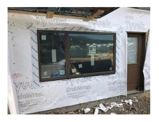
Bldg F1 Unit 16 Basement Left Window Installed