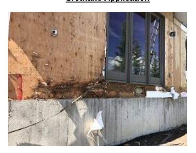
Building E7 Unit 49 Deck Blocking Area Defined