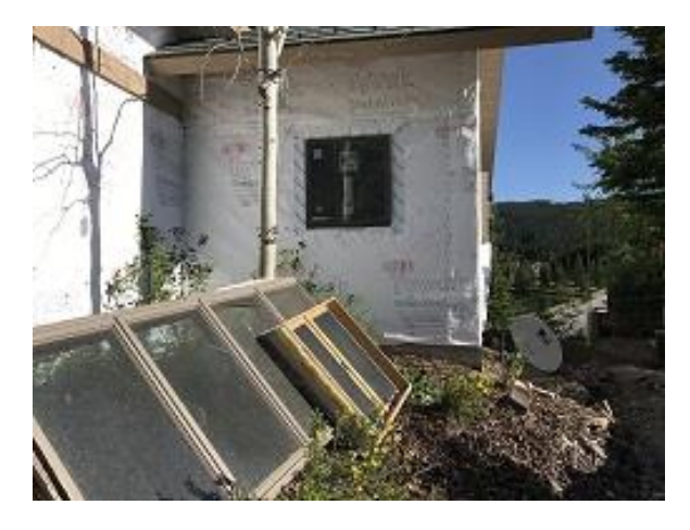
Building F1 Unit 16 Kitchen Window Installed