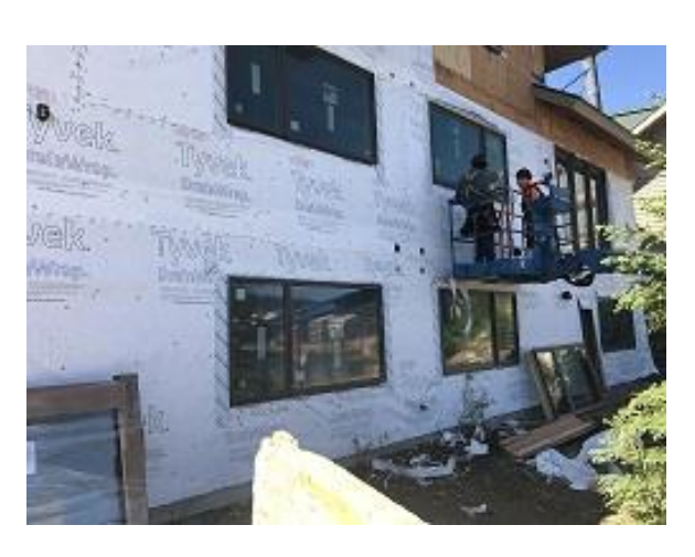
Building F1 Unit 16 & 17 Window Installation