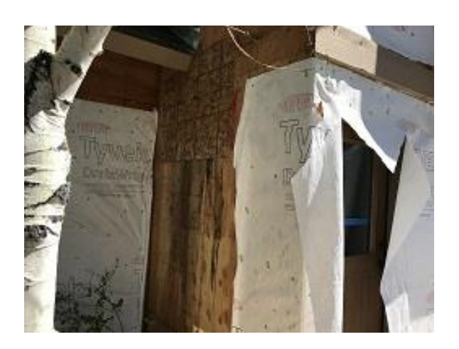
Building F1 Unit 17 Sheathing Replacement