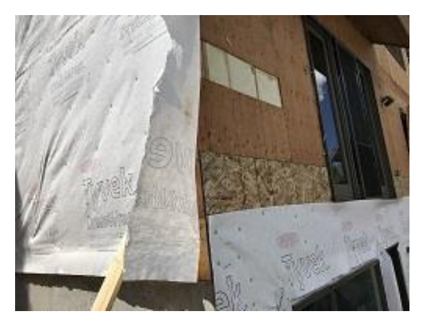
Bldg F1 Unit 16 Upper Deck Railing Blocking Location Cut Out