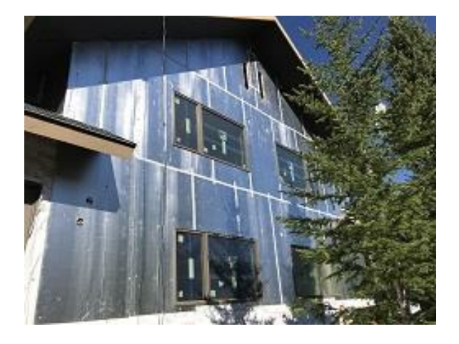
Building E3 Unit 24 & 25 New Attic Vents Cut In