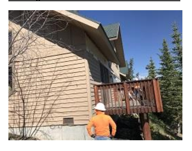
Building E7 Unit 49 Demo Continues