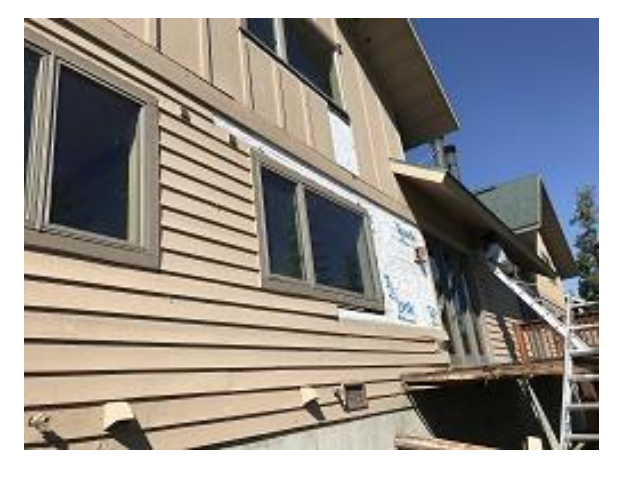
Building E7 Unit 49 & 50 Demo