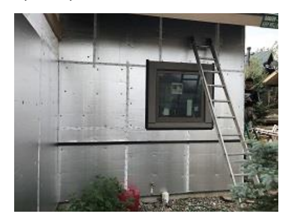
Building E1 Unit 11 Front Window Trim & J Channel Installed