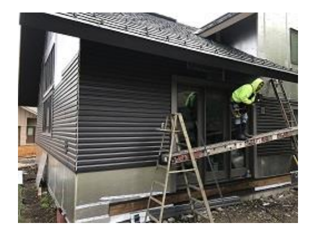
Building E1 Unit 11 Back Lap Siding Installed