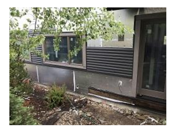
Building E1 Unit 9 Back Lap Siding Installed