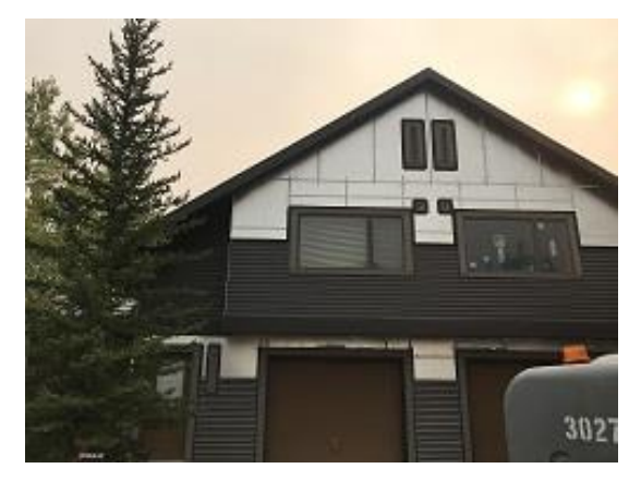
Building E3 Unit 26 & 27 Front Lap Siding Installed Bui