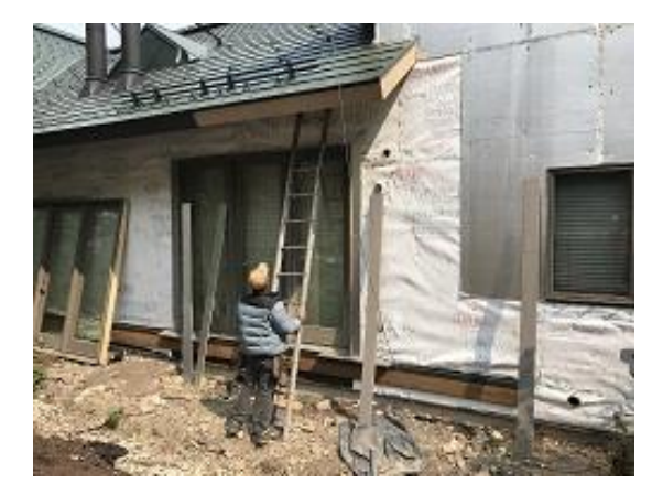
Building E1 Unit 9 Back Door Trim & J Channel Installed