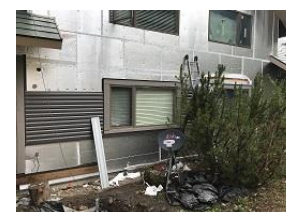
Building E1 Unit 10 Back Lap Siding Installed