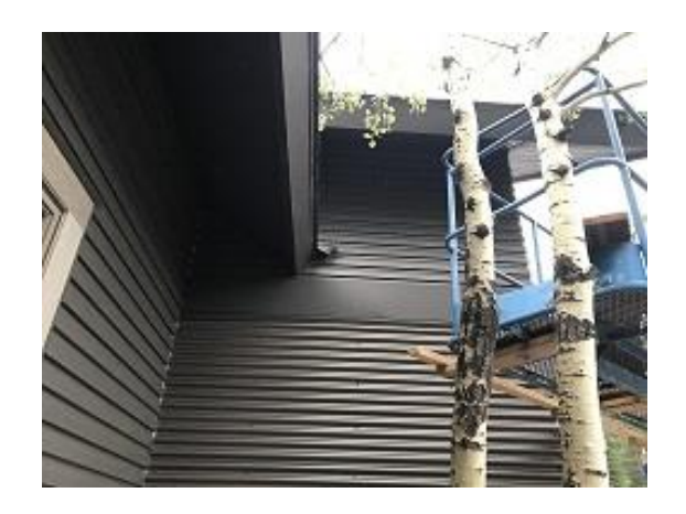
Building E3 Unit 26 Front Upper Lap Siding Installed