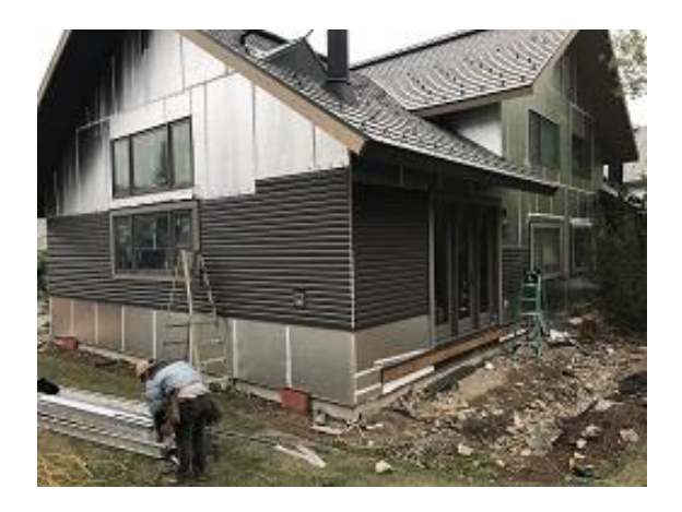
Building E1 Unit 11 Side & Back Lap Siding Installed

Building E3 Unit 27 Front Lap Siding Installed