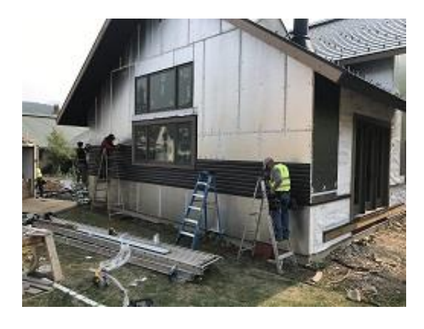
Building E1 Unit 11 Side Lap Siding Installed