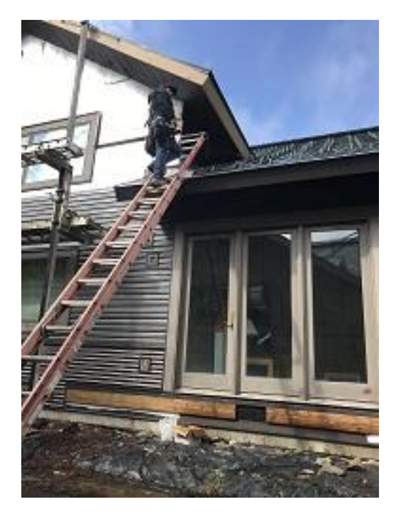
Building E3 Unit 25 Back Flashing and J Channel Installed