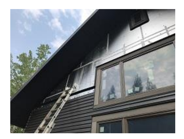
Building E3 Unit 27 Side J Channel Installed