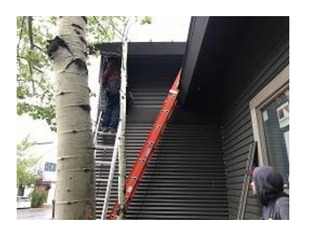
Building E3 Unit 25 Front Upper Lap Siding Installed