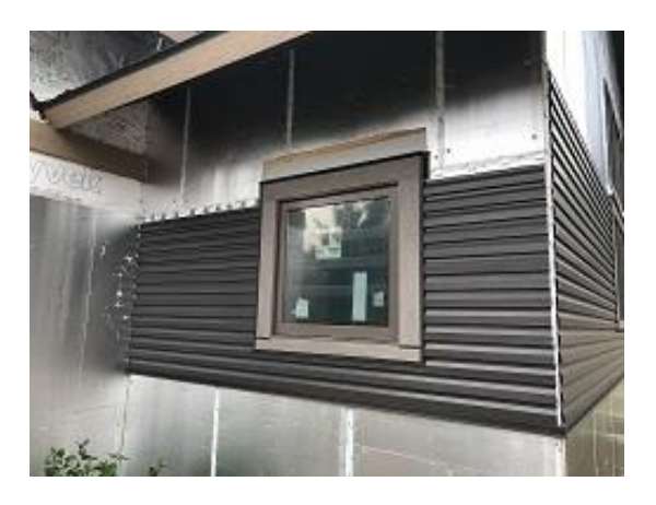
Building E1 Unit 11 Front Lap Siding Installed