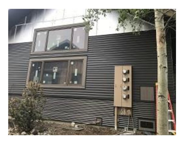
Building E3 Unit 24 Side Lap Siding Completed