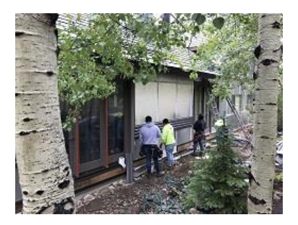
Building E1 Units 9 & 10 Back Lap Siding Installed