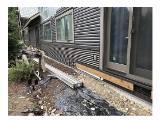
Building E3 Unit 24 & 25 Wainscote Siding Installation