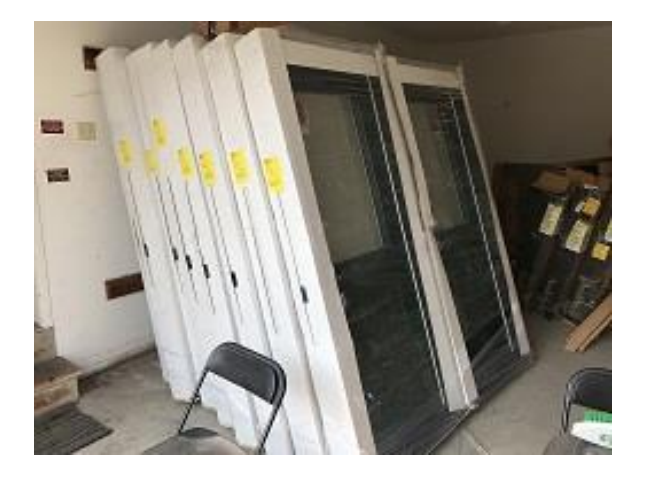
Balance of Doors Delivery