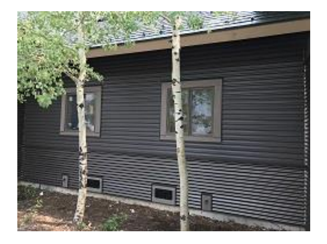
Building E3 Unit 25 & 26 Kitchen Lap Siding Installation