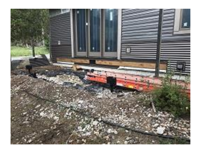
Building E3 Unit 27 Helical Pier Installation