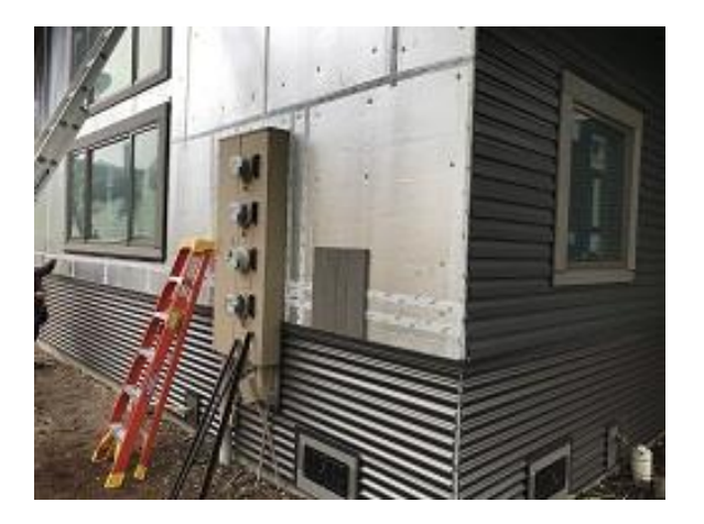
Building E3 Unit 24 Side Lap Siding 3 Rivers Blocking Installed