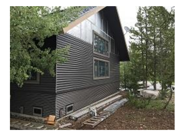
Building E3 Unit 27 Side Lap Siding Installed