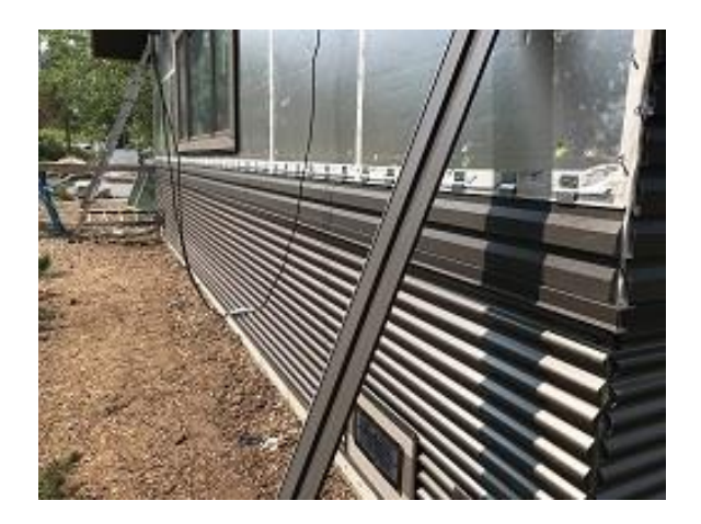
Building E3 Unit 27 Side Lap Siding Installation

Building E3 Unit 24 Kitchen Lap Siding Installation