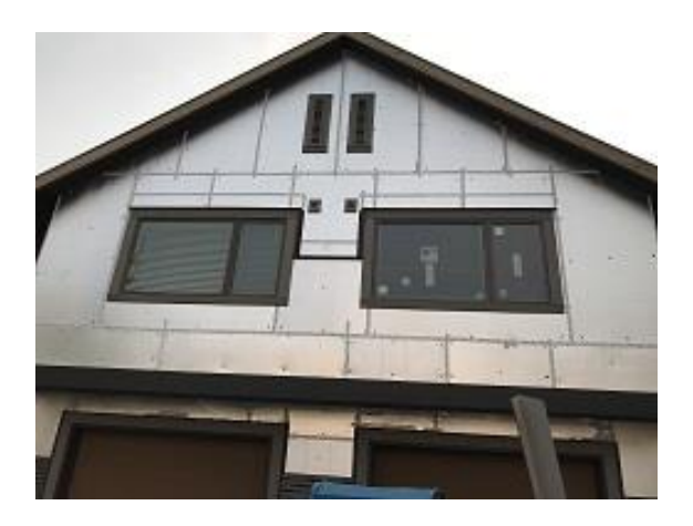
Building E3 Unit 26 & 27 Head Trim and J Channel for Board & Batten Siding Installation

Building E3 Unit 27 Side Lap Siding Installation