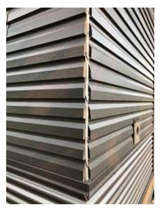
Building E3 Unit 27 Lap Siding Corner