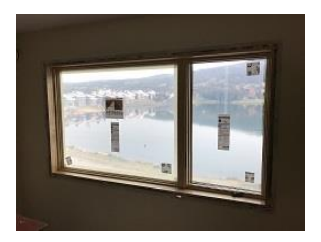
Building F1 Unit 16 Interior Window Finish