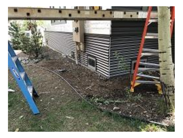
Building E3 Unit 24 Side Wainscote Siding Installation