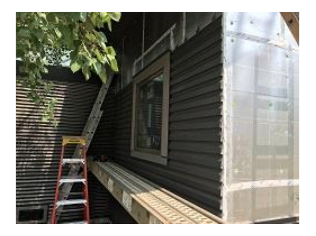
Building E3 Unit 27 Kitchen Lap Siding Installation