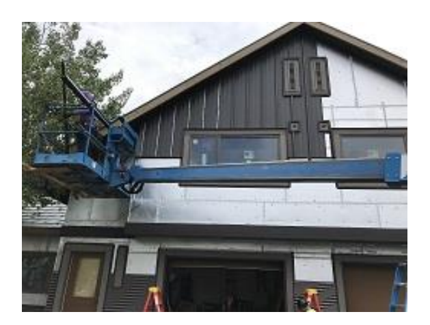
Building E3 Unit 24 Board & Batten Siding Installation

Building E1 Unit 10 Helical Pier Installation