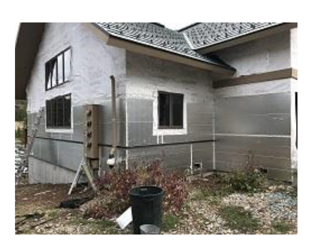
Building E7 Unit 52 Side Wainscot Flashing & Foam Board Installed