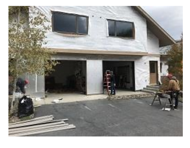
Building E7 Units 49 & 50 Front Garage Door Metal & Foam Board Installed