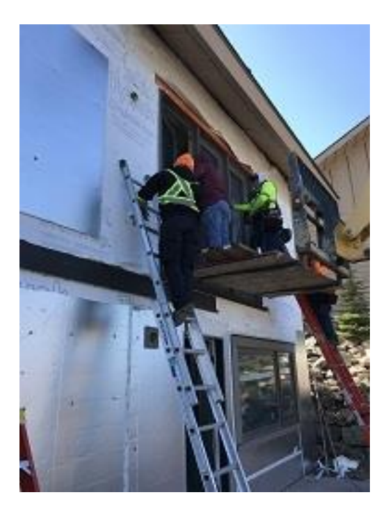
Building F1 Unit 17 Deck Door Installed