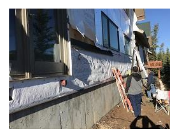
Building E7 Unit 49 Back Wainscot Flashing Installed