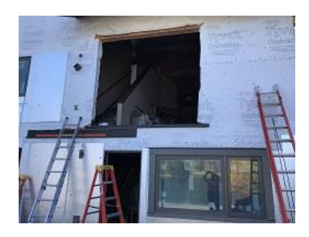
Building F1 Unit 17 Deck Door Flashing Installed