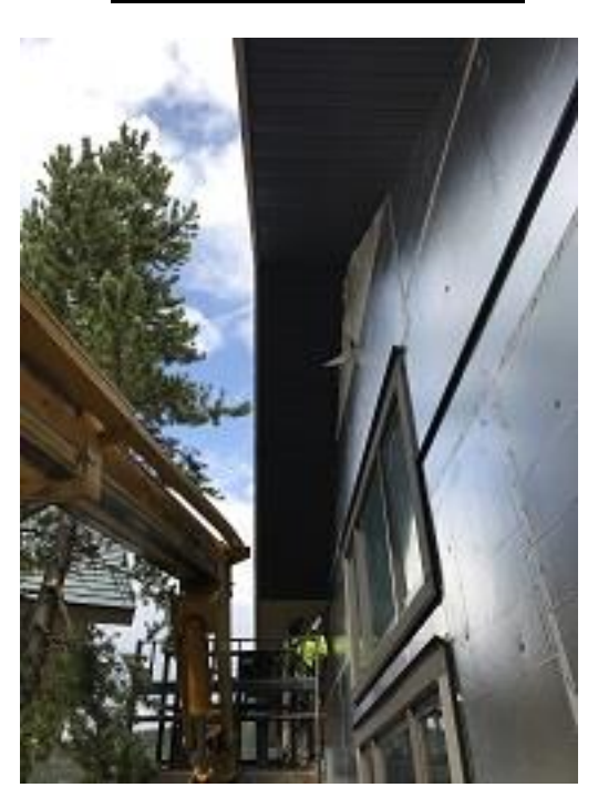
Building F1 Unit 17 Side Soffit Installed