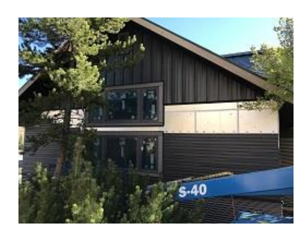
Building F1 Unit 17 Side Board and Batten Siding Installed