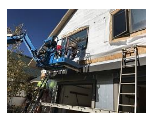
Building E7 Unit 50 Front Upper Window Installed