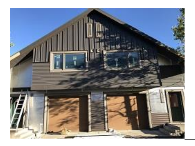
Building F1 Units 16 & 17 Front Board and Batten Siding Installed