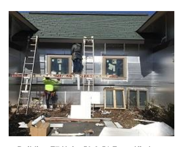
Building E7 Units 50 & 51 Front Kitchen Windows, Trim & Foam Board Installed