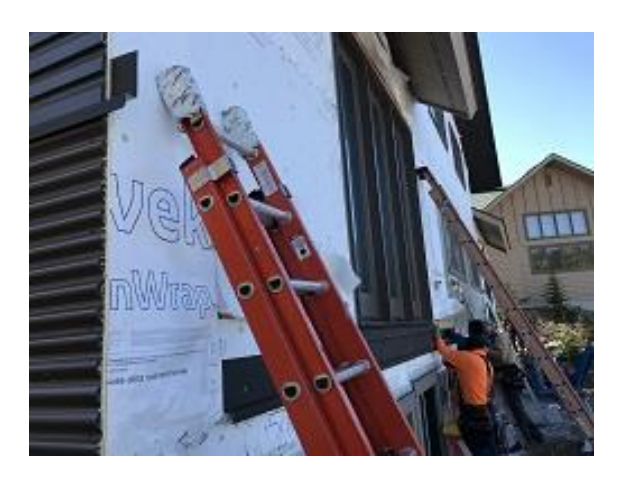
Building F1 Unit 16 Back Deck Door and Ledger Flashing Installed