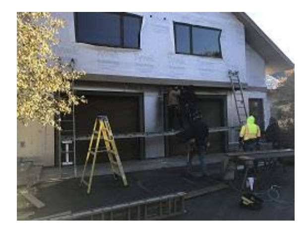
Building E7 Units 49 & 50 Front Soffit Installed