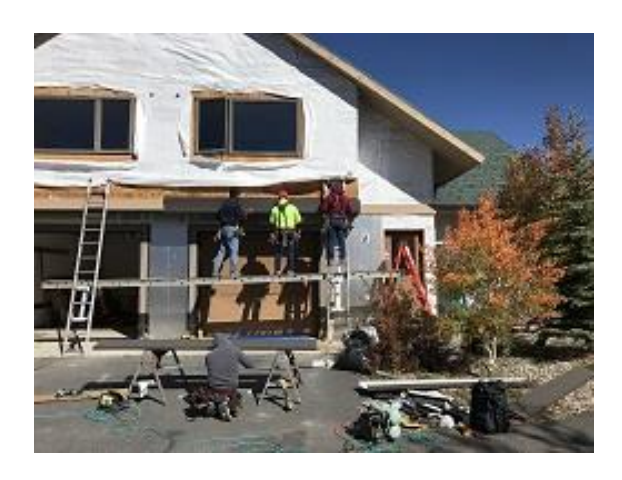
Building E7 Units 49 & 50 Front Belly Band Installed