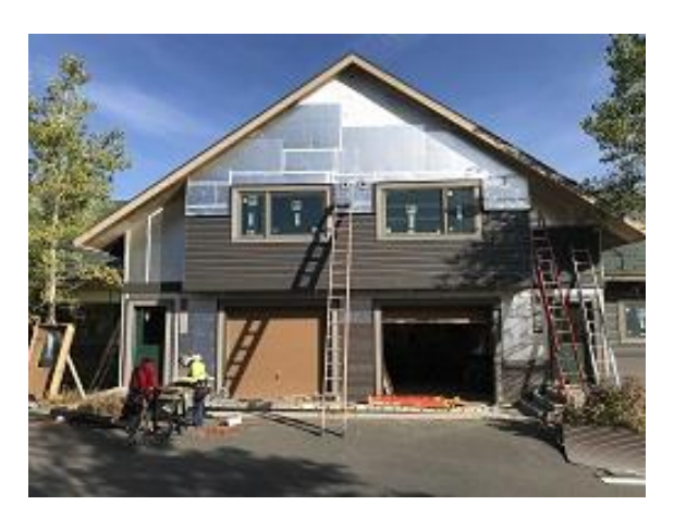
Building F1 Units 16 & 17 Front Lap Siding Installed