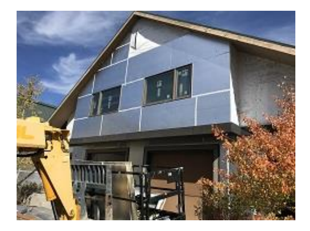
Building E7 Units 49 & 50 Front Foam Board Installed