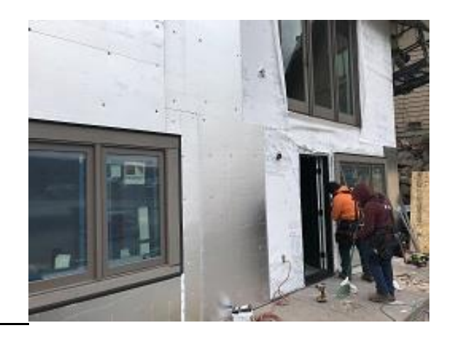
Building F1 Unit 17 Back Window Trim & Foam Board Installed