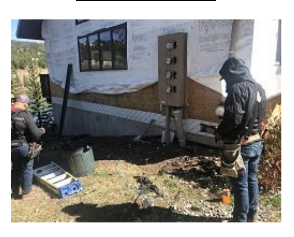
Building E7 Unit 52 Side Base Flashing Tape Installed