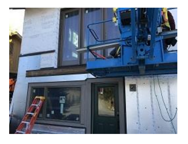
Building F1 Units 16 & 17 Back Wainscot Flashing and J Channel Installed