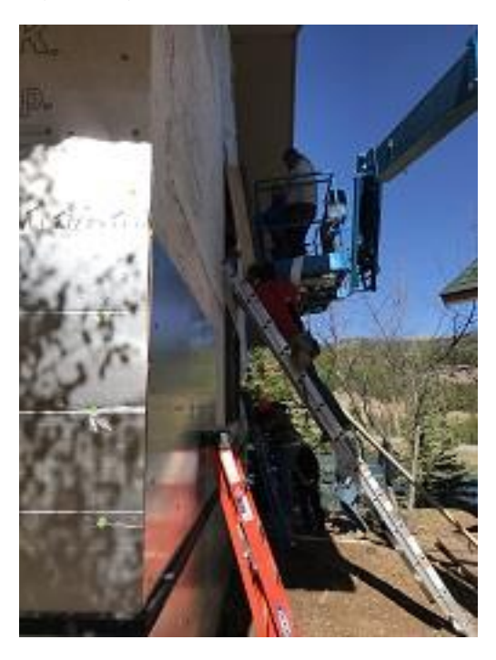
Building E7 Unit 49 Side Windows Installed