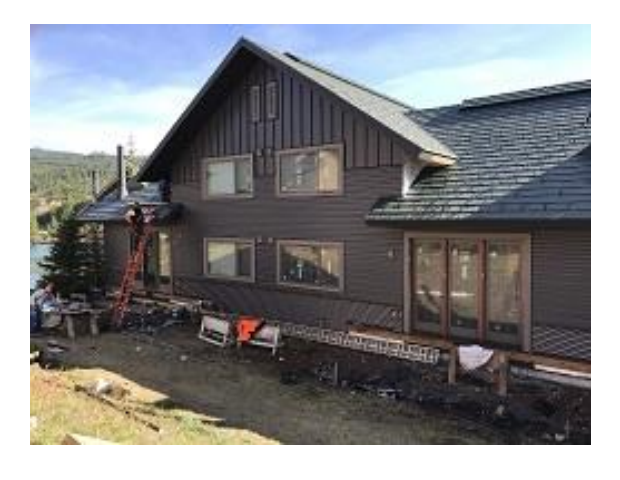
Building E2 Units 20 & 21 Back Board and Batten Siding Installed