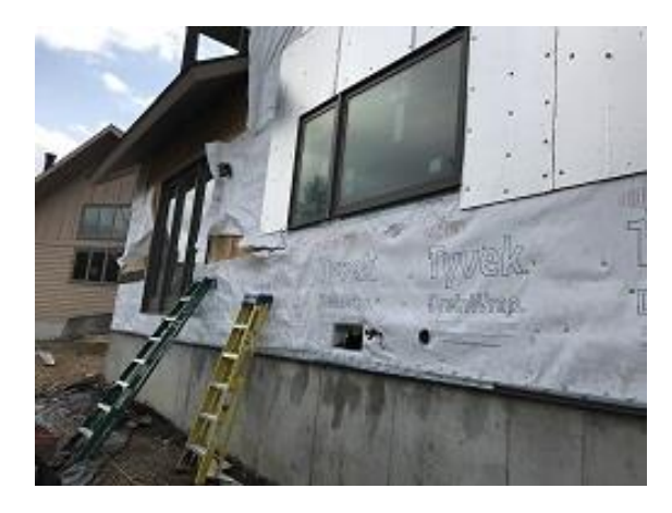
Building E7 Unit 49 Back Base & Wainscot Flashing Installed