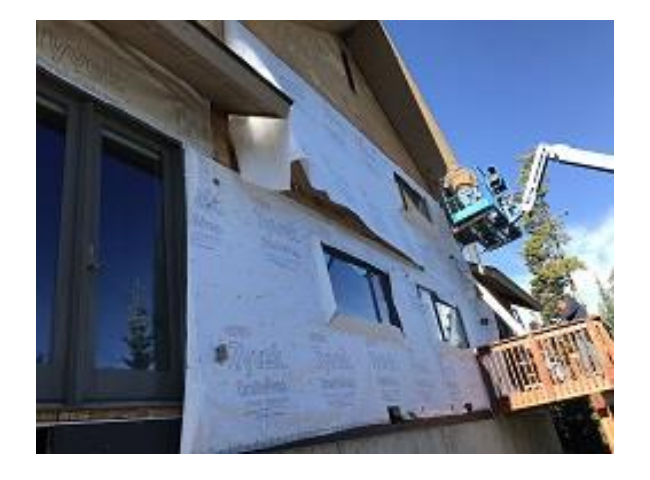
Building E7 Units 51 & 52 Back Tyvek Installed