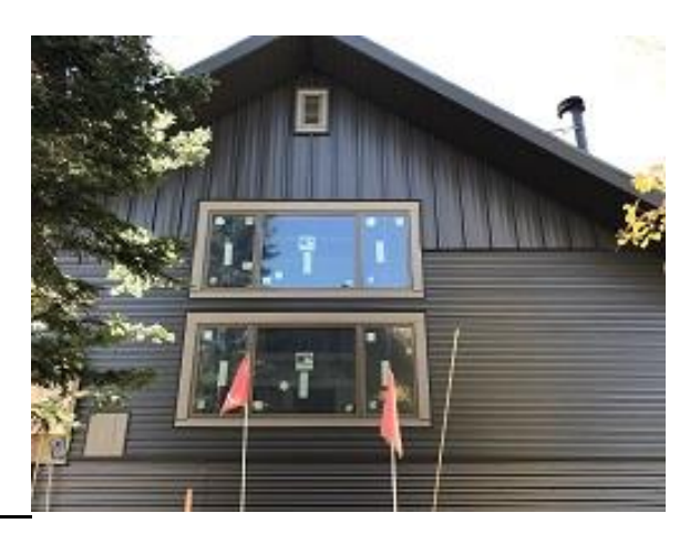
Building F1 Unit 16 Side Board and Batten Siding Installed