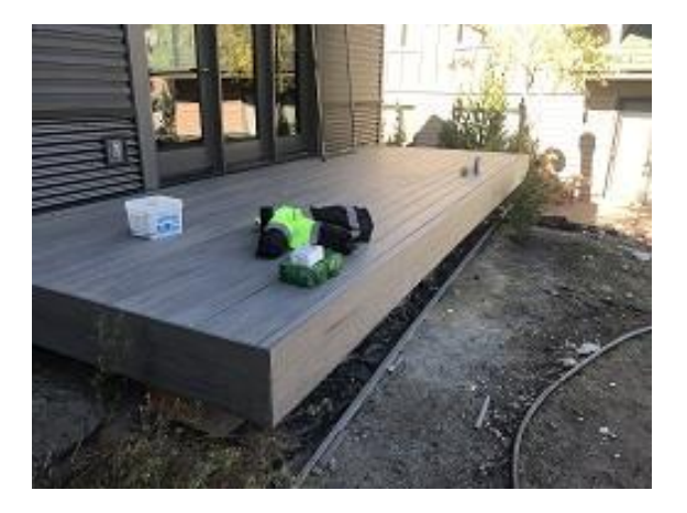
Building E3 Unit 24 Decking Completed