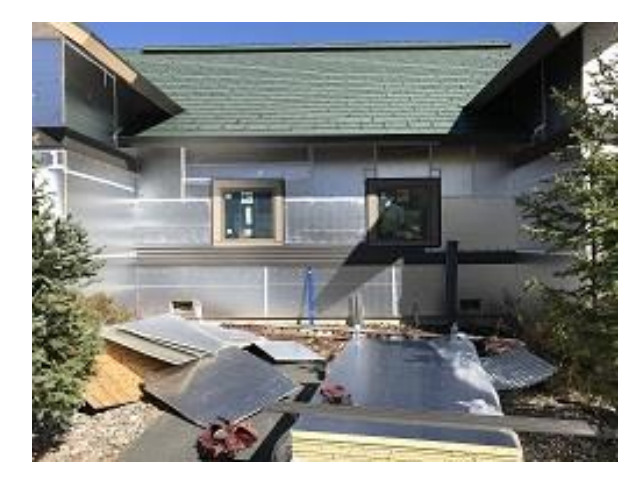
Building E7 Units 50 & 51 Front Lap Siding Installed