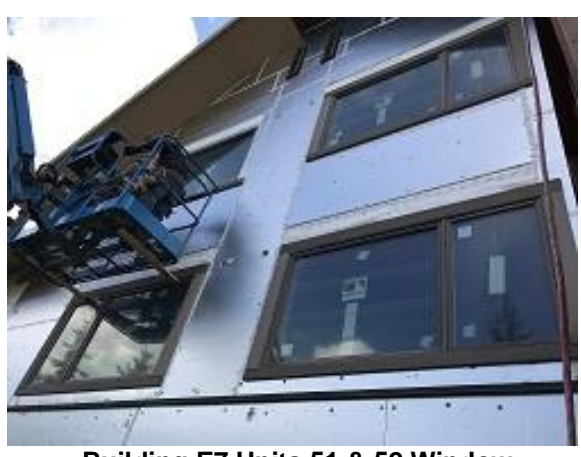
Building E7 Units 51 & 52 Window Trim Installed