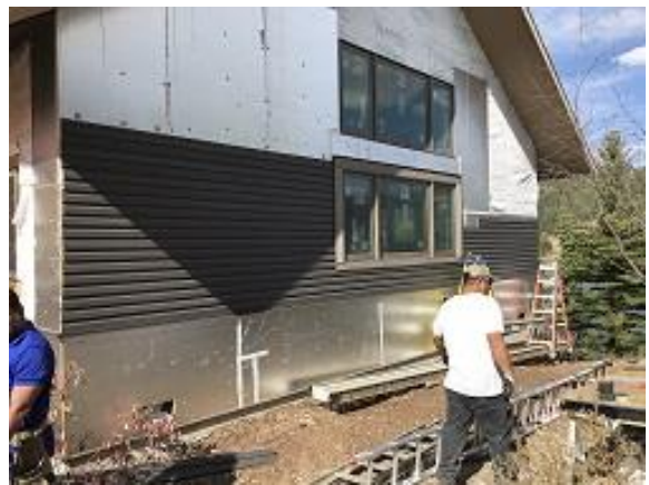
Building E7 Unit 49 Lap Siding Installed