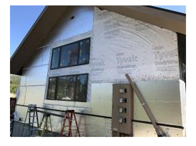
Building E7 Unit 52 Side Foam Board Installed