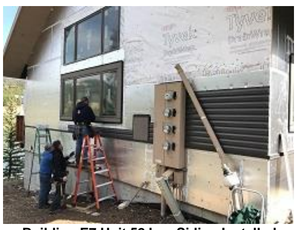
Building E7 Unit 52 Lap Siding Installed