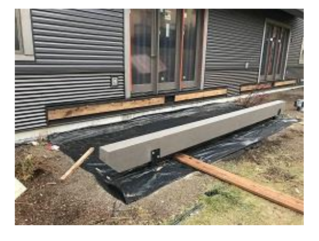
Building E2 Unit 21 Deck Framing Began