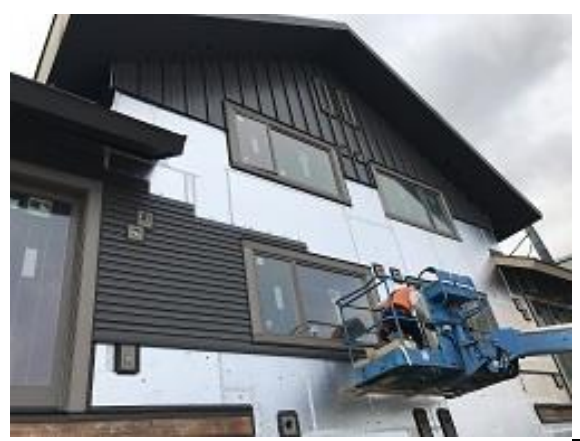
Building F1 Units 16 & 17 Back Lap Siding Installed