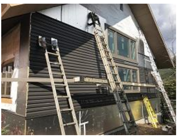
Building E7 Unit 49 Side Lap Siding Installed