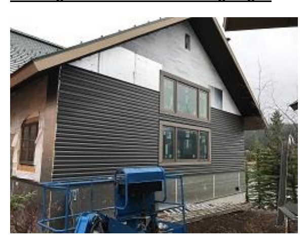
Building E7 Unit 49 Side Lap Siding Installed