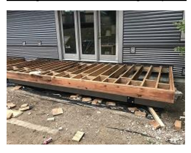
Building E4 Unit 30 Deck Framing Completed