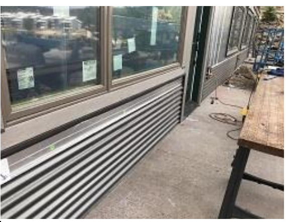
Building F1 Unit 16 Back Corrugated Siding Installed