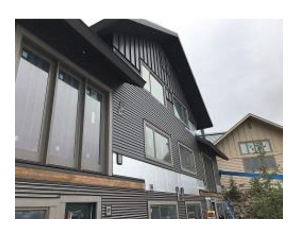
Building F1 Units 16 & 17 Lap and Corrugated Siding Installed