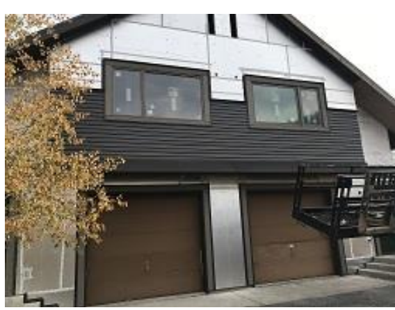
Building E7 Units 49 & 50 Front Lap Siding Installed