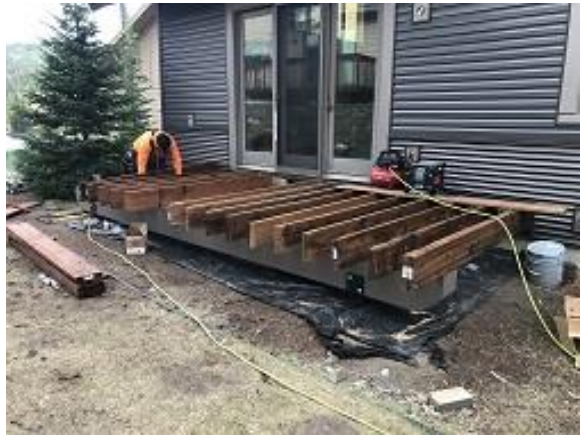
Building E2 Unit 20 Deck Framing