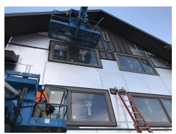
Building F1 Units 16 & 17 Board and Batten Siding Installed