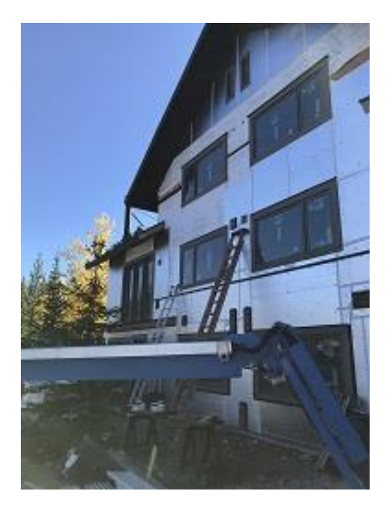
Building F1 Unit 16 & 17 J Channel, Blocking Installed