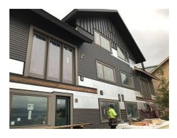
Building F1 Units 16 & 17 Back Lap & Corrugated Siding Installed