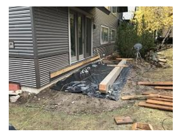
Building E1 Unit 11 Deck Framing Began