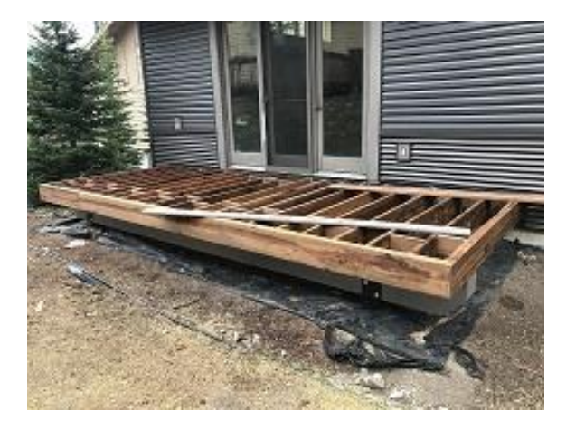
Building E2 Unit 20 Deck Framing Completed