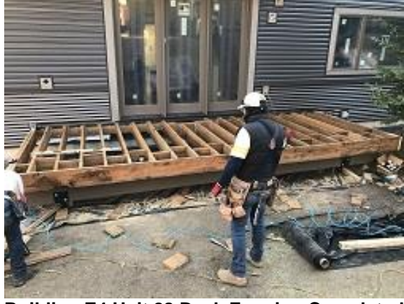
Building E4 Unit 28 Deck Framing Completed