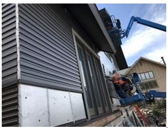
Building F1 Unit 16 Lap Siding Installed