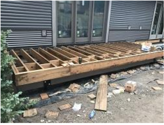
Building E4 Unit 29 Deck Framing Completed