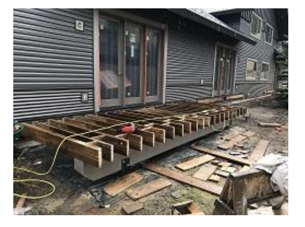
Building E2 Unit 21 Deck Framing Installed