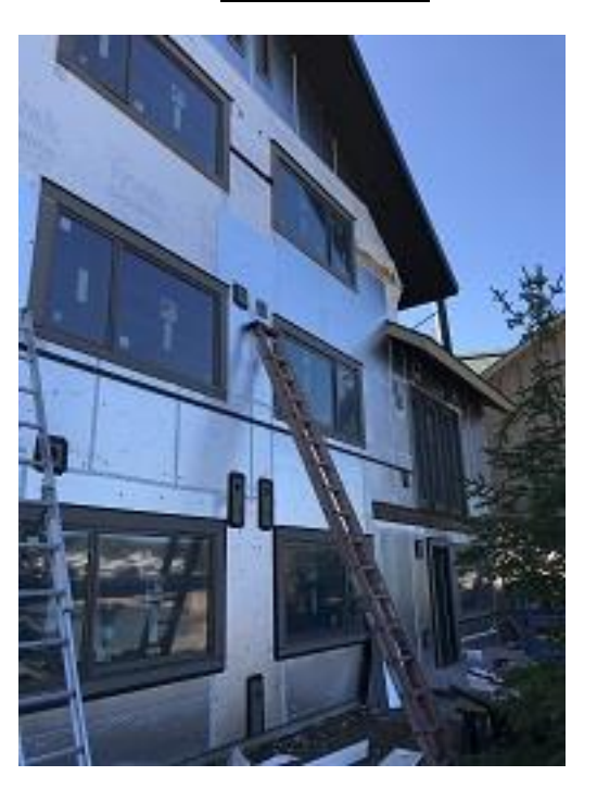
Building F1 Unit 16 & 17 J Channel, Blocking Installed