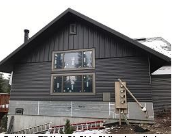
Building E7 Unit 52 Side Siding Installation