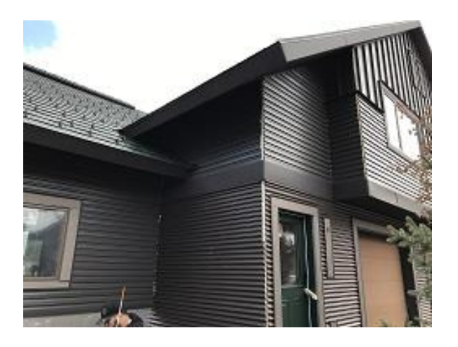
Building E7 Unit 50 Side Lap Siding & Diverter Installation