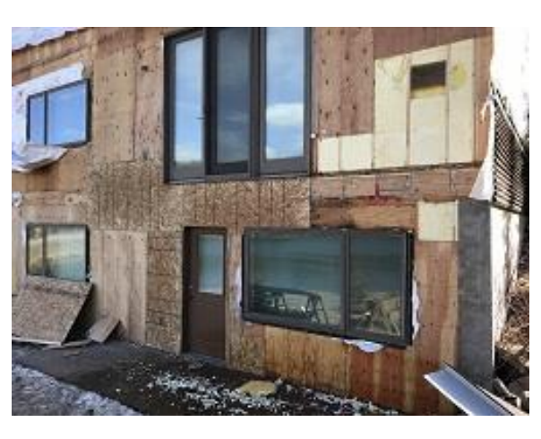
Building F2 Unit 19 Deck Blocking Sheathing Installation