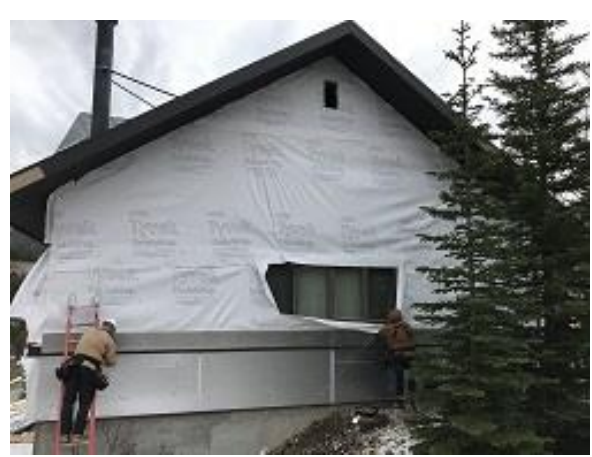
Building F2 Unit 19 Side Base & Wainscot Flash Installation