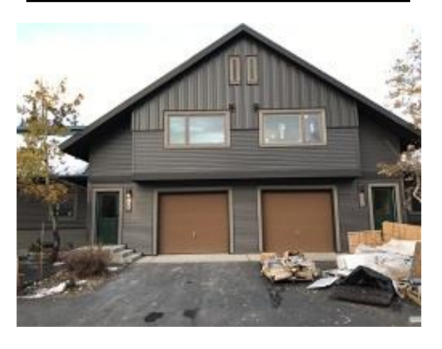
Building E4 Units 28 & 29 Addresses Applied