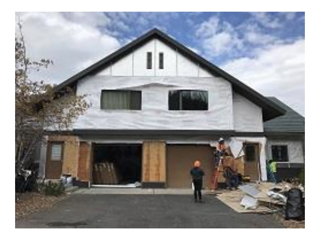
Building F2 Units 18 & 19 Front Tyvek, Belly Band, Base Flashing & Foam Board Install