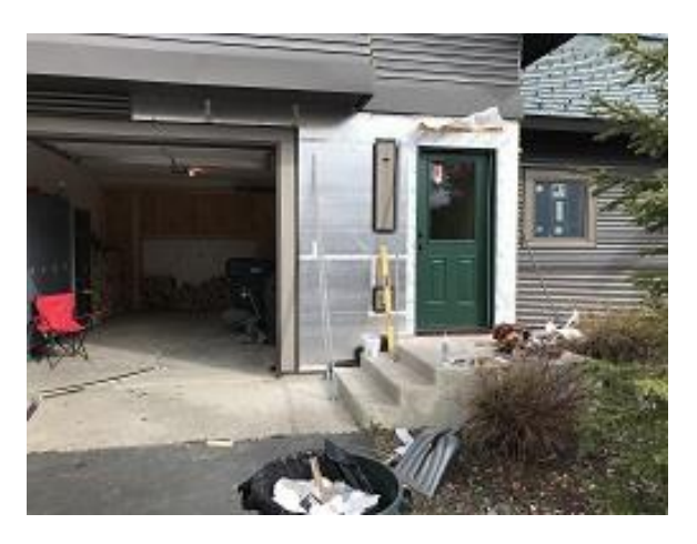
Building E7 Unit 51 Front Door Installation