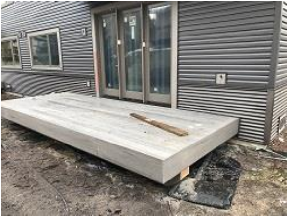
Building E2 Unit 23 Deck Complete