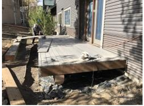
Building E1 Unit 8 Decking Installation