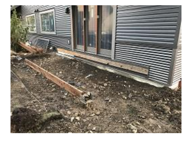
Building E1 Unit 8 Deck Grading Completed