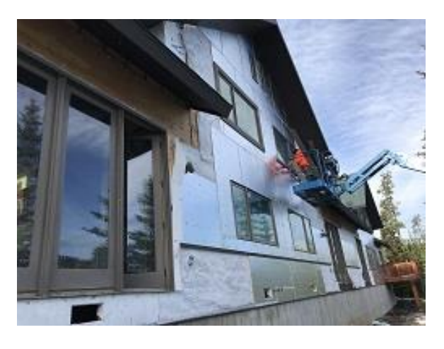
Building E7 Units 49 & 50 Back Window <u>Trim Installation</u>