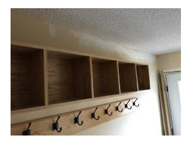
Building E4 Unit 28 Entry Interior Drywall Repair Progressing