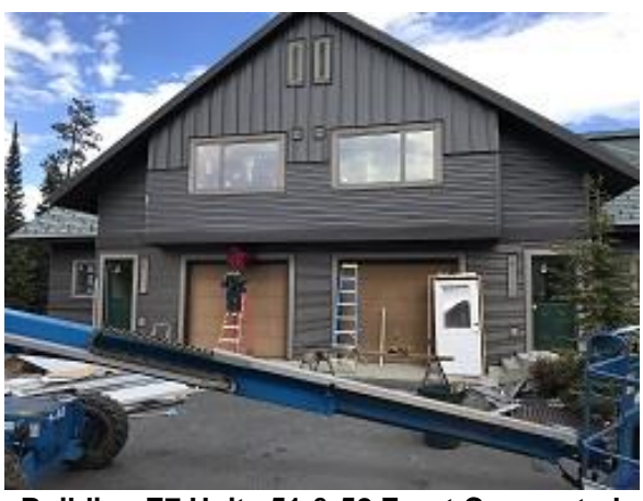
Building E7 Units 51 & 52 Front Corrugated Siding Installation