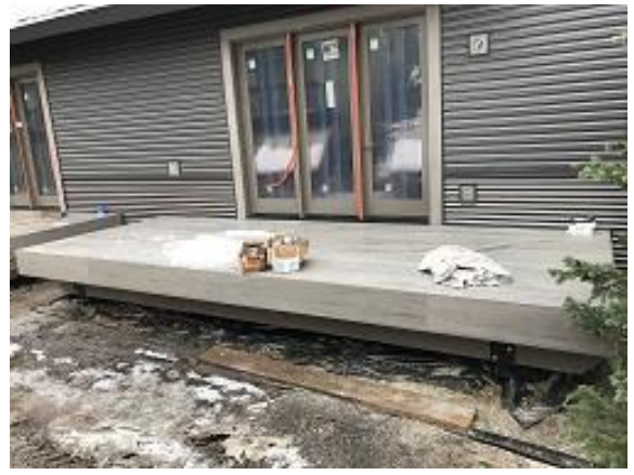
Building E2 Unit 22 Deck Complete