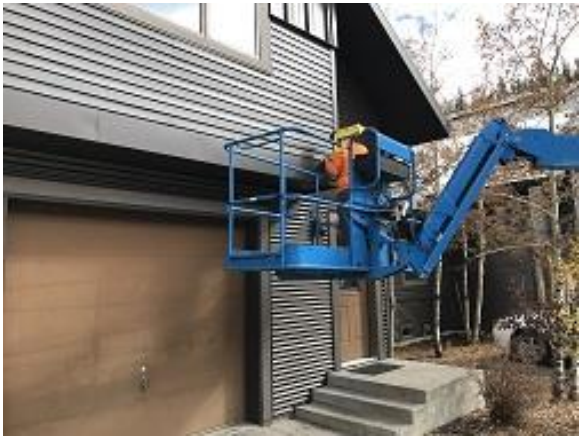
Building E3 Unit 25 Front Caulking Applied