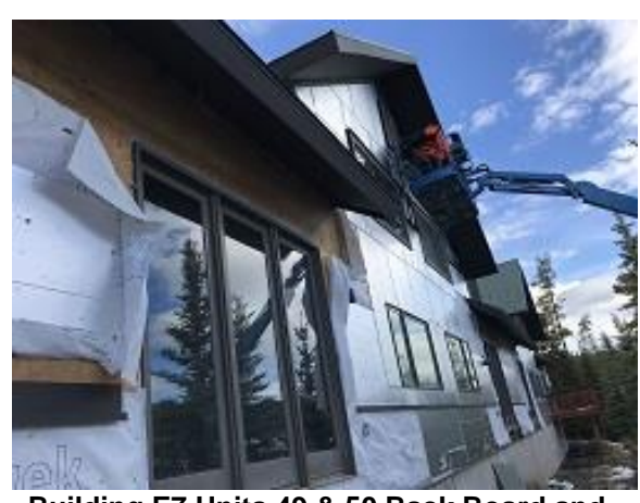
Building E7 Units 49 & 50 Back Board and Batten Siding Installation