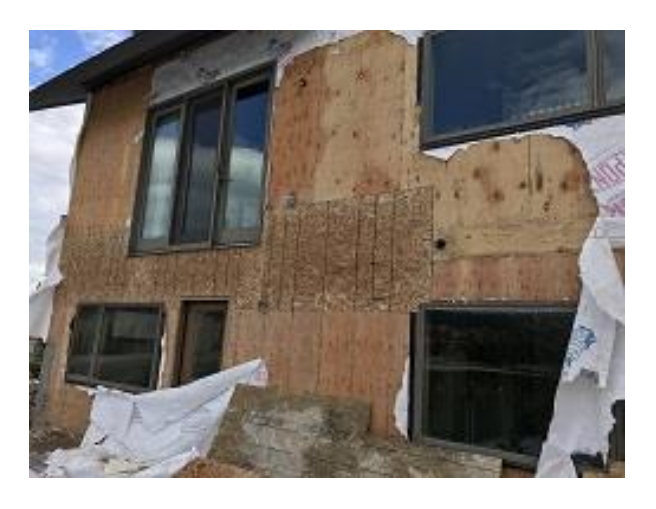
Building F2 Unit 18 Back Deck Sheathing Installation