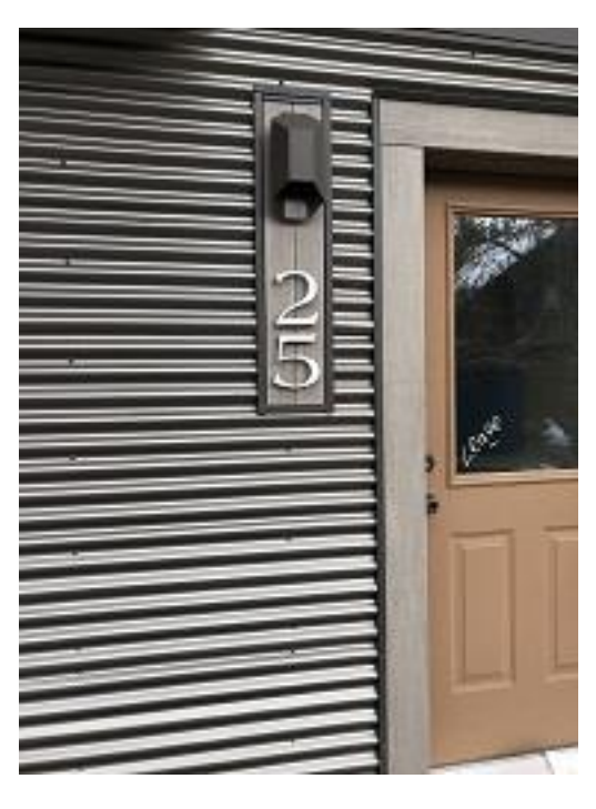
Building E3 Address Numbers Applied