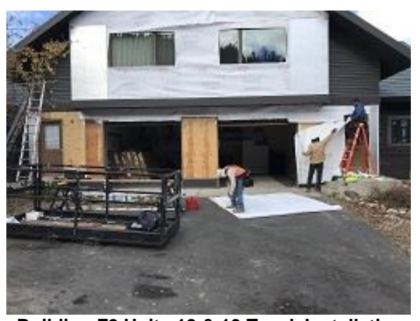
Building F2 Units 18 & 19 Tyvek Installation