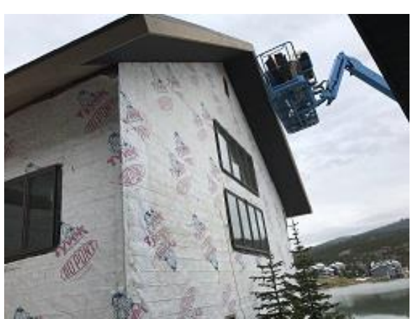
Building F2 Unit 18 Side Fascia & Soffit Installation