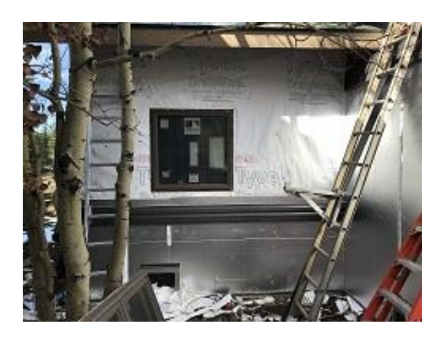
Building F2 Unit 19 Kitchen Window, Wainscot Flashing & Foam Insulation Installation