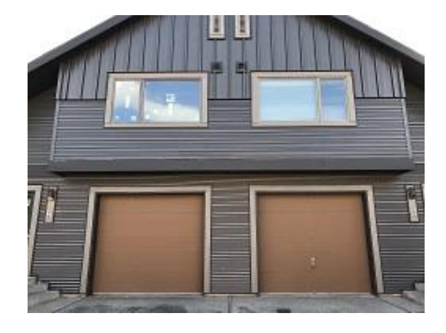
Building E1 Units 8 & 9 Addresses Applied