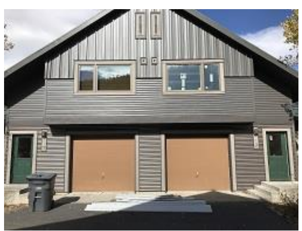
Building F1 Units 16 & 17 Addresses and <u>Lighting Installation</u>