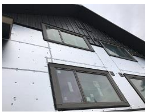
Building E7 Units 51 & 52 Back Board and Batten Installation