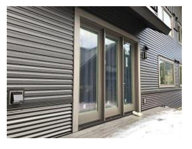
Building E3 Unit 24 Back Vents Installed