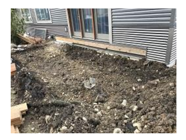
Building E1 Unit 8 Deck Area Grading