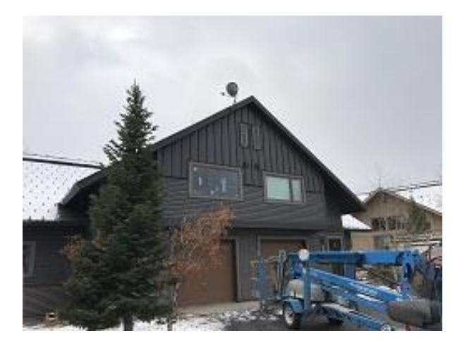
Building E1 Units 10 & 11 Satellite Dishes Installation