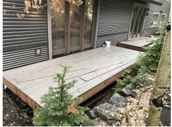
Building E1 Unit 10 Decking Installation