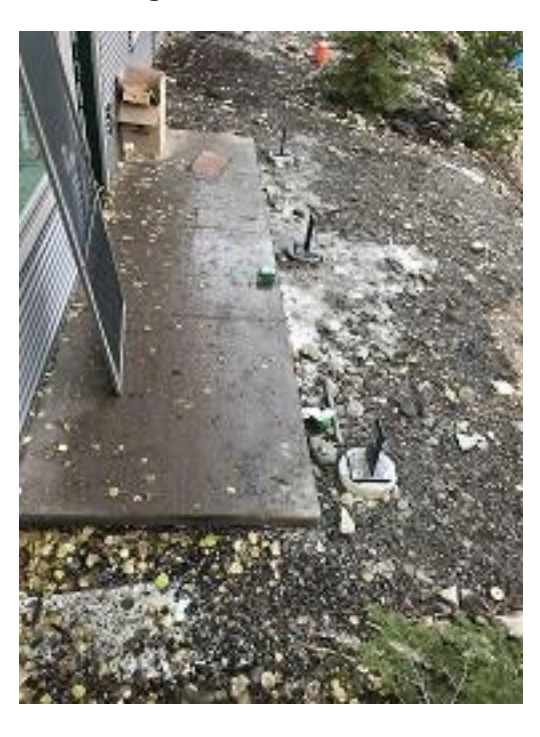
Building F1 Unit 16 Deck Knife Plates Installed