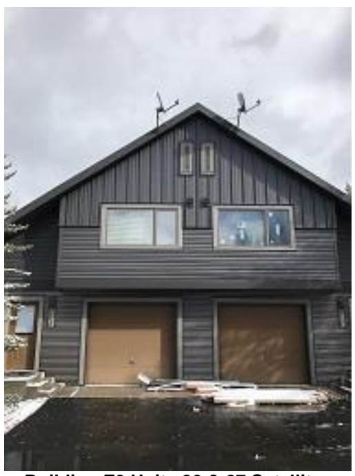
Building E3 Units 26 & 27 Satellite Dish Installation