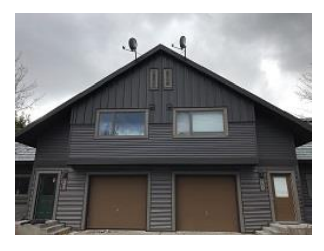
Building E4 Units 30 & 31 Satellite Dishes Installed