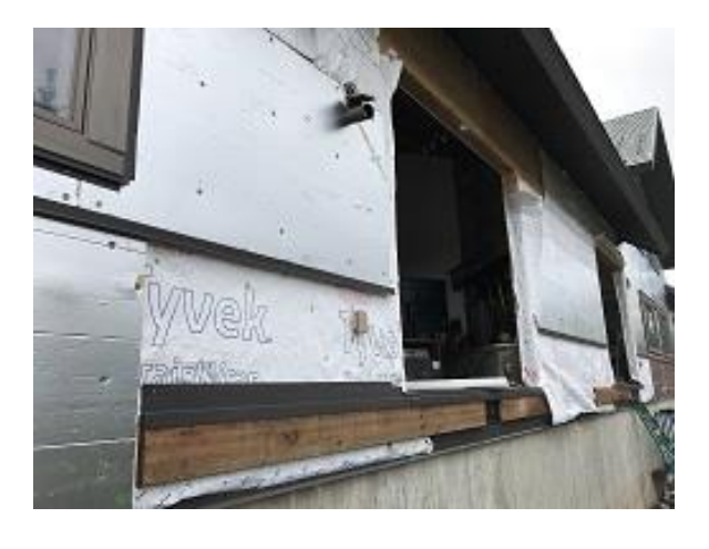
Building E7 Unit 50 Deck Door Installation