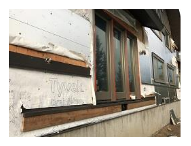
Building E7 Unit 49 Deck Door Installed