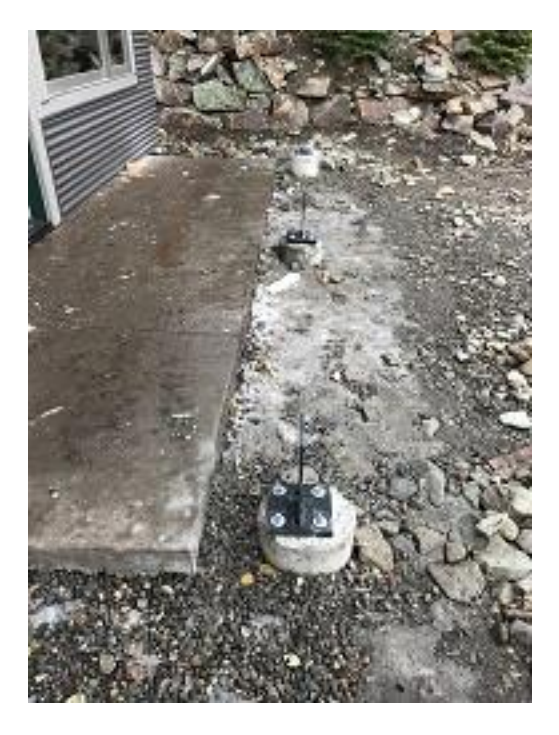
Building F1 Unit 17 Deck Knife Plates Install