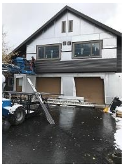
Building F2 Units 18 & 19 Front Lap Siding Installation