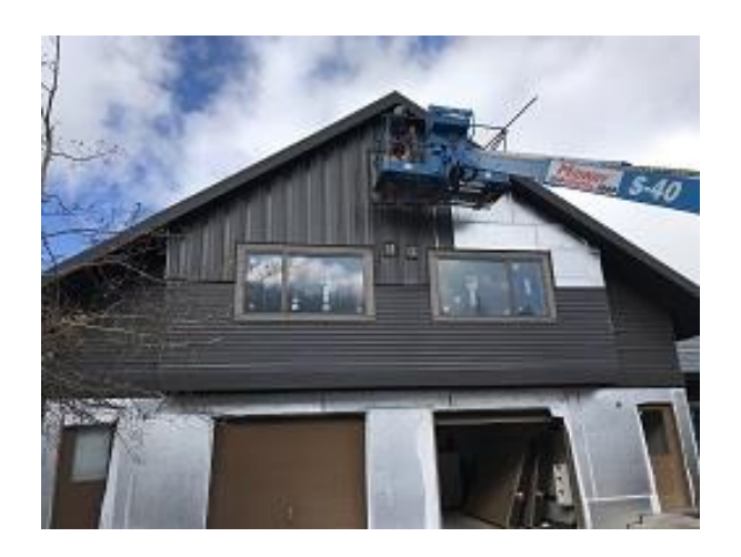
Building F2 Units 18 & 19 Front Board and Batten Siding Installation