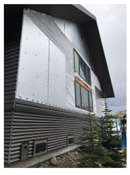
Building F2 Unit 18 Side Windows Install