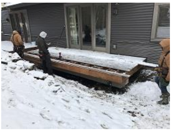
Building E1 Unit 09 Decking Installation