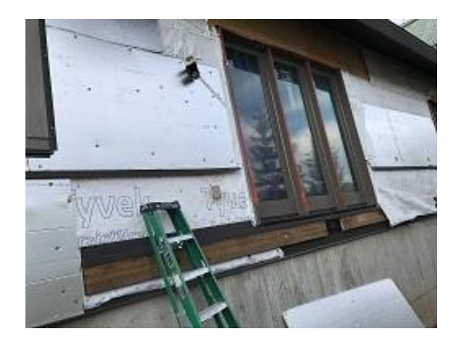
Building E7 Unit 50 Deck Door Installed