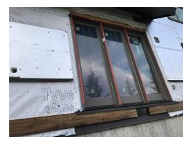
Building E7 Unit 51 Deck Door Installed