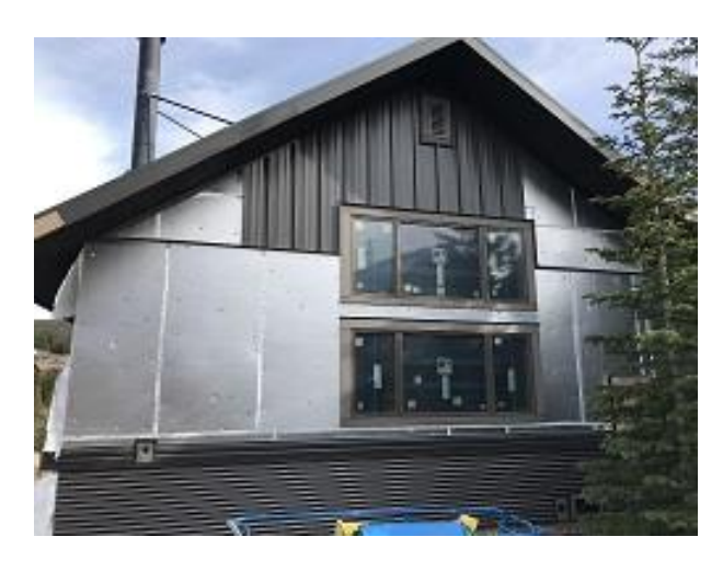
Building F2 Unit 19 Side Board and Batten Siding Installation