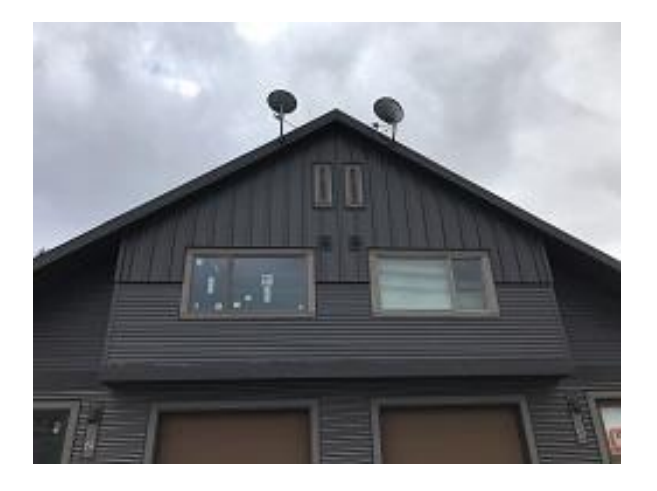
Building E1 Units 8 & 9 Satellite Dishes Installed