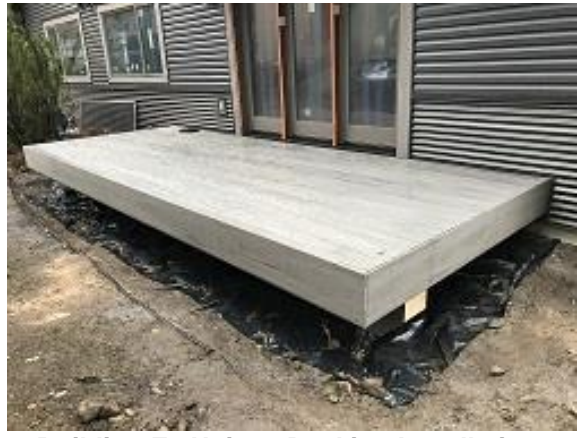
Building E1 Unit 08 Decking Installation