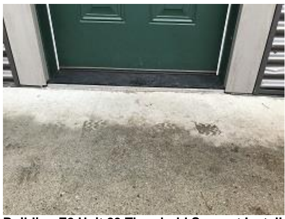
Building E2 Unit 23 Threshold Support Install