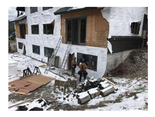
Building F2 Unit 19 Back Window Installation