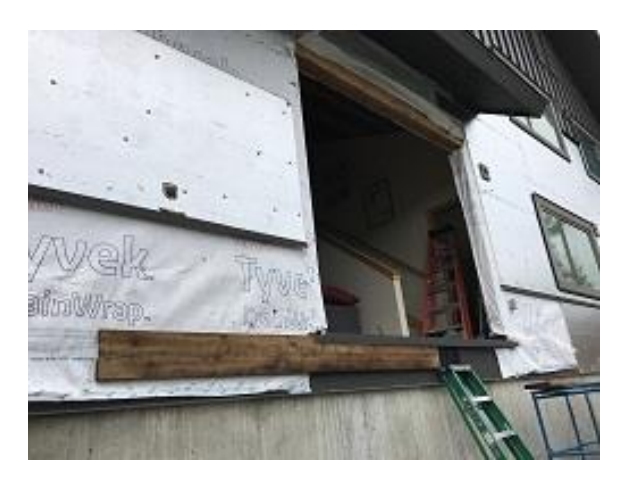
Building E7 Unit 51 Deck Door Installation