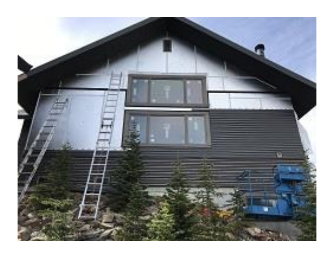
Building F2 Unit 18 Side Lap Siding Installation