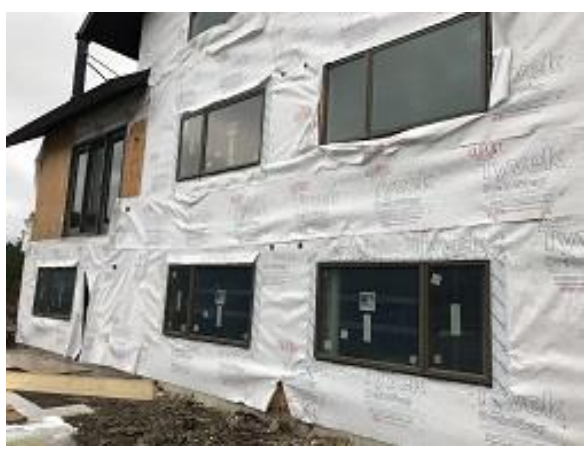
Building F2 Units 18 & 19 Back Window Install