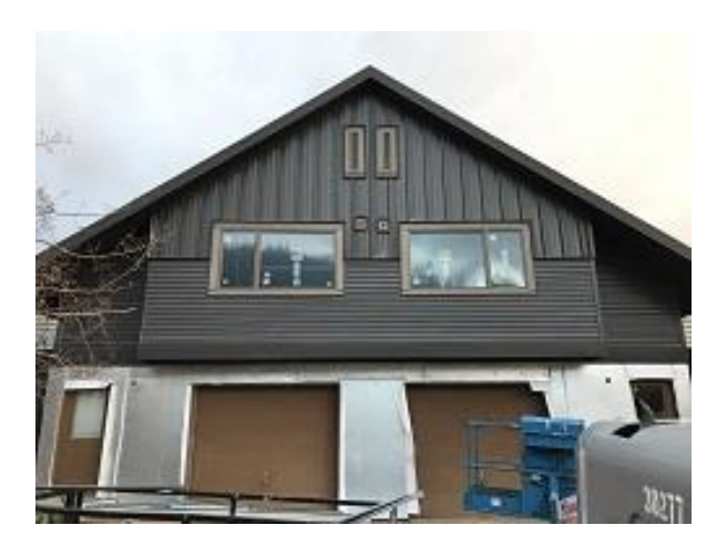
Building F2 Units 18 & 19 Board and Batten Install