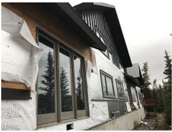
Building E7 Units 49 & 50 Back Board and Batten Siding Installation