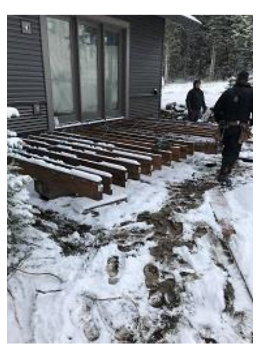
Building E41 Unit 31 Deck Framing