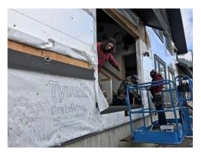
Building E7 Unit 49 Deck Door Installation