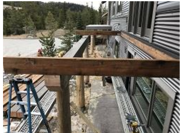
Building F1 Unit 17 Deck Framing Continued