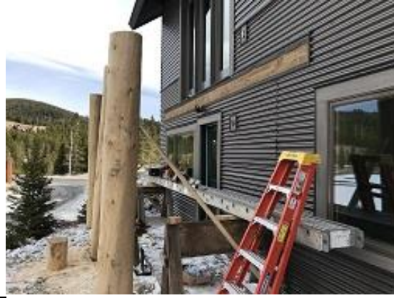
Building F2 Unit 18 Deck Logs & Ledger Bolts Installed