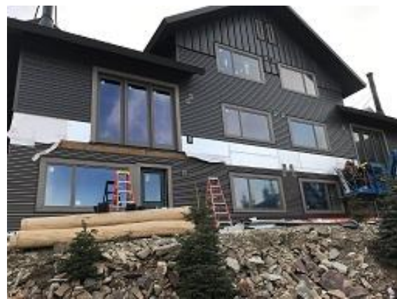
Building F2 Units 18 & 19 Back Corrugated Siding Installed