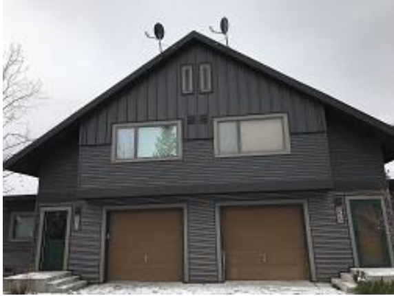
Building E2 Unit 22 Storm Door Installed