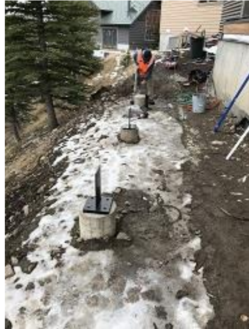
Building E7 Units 49 - 51 Deck Knife Plates Installed