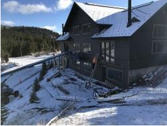
Building F2 Units 18 & 19 Deck Posts Installed, Back Wainscot Siding Installed