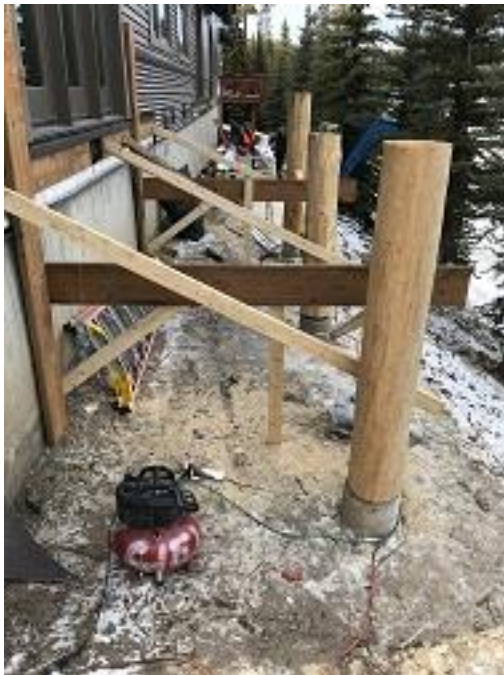
Building E7 Units 49 Deck Log Post Installation