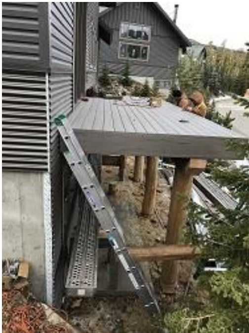
Building F1 Unit 16 Decking Installed