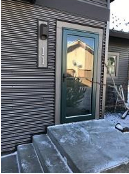
Building E1 Unit 11 Storm Door Installed