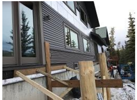
Building E7 Units 49 & 50 Back Lap Siding Installation