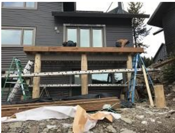
Building F1 Unit 17 Decking Installation