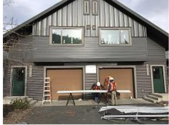
Building F2 Units 18 & 19 Front Corrugated Siding Installed