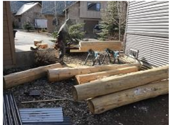
Building E7 Units 49 -51 Deck Posts Prepared for Installation