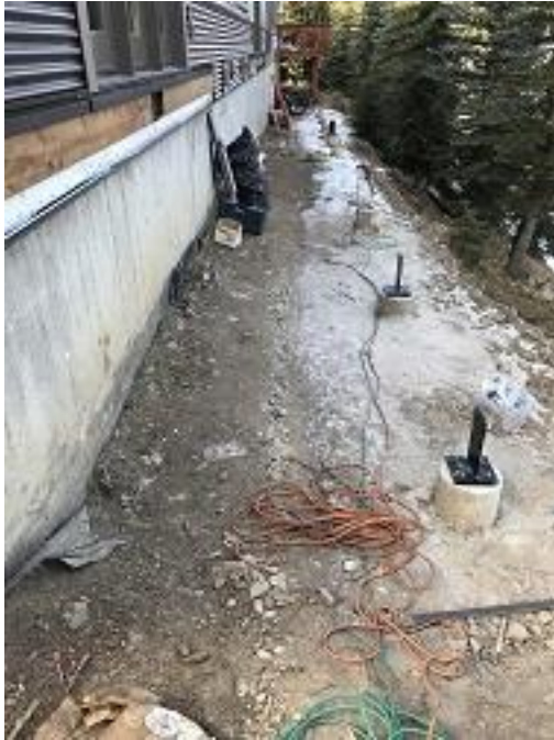
Building E7 Units 49 -51 Deck Knife Plates Installed