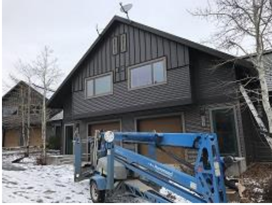
Building F1 Units 16 Satellite Dish, Wire and Storm Door Installation