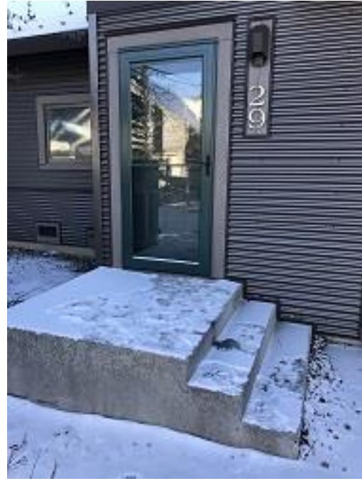
Building E4 Unit 29 Storm Door Installed