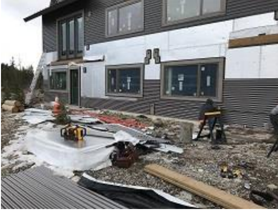
Building F2 Units 18 & 19 Back Corrugated Siding Installed