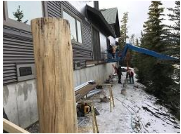
Building E7 Unit 51 Deck Knife Plates Installed