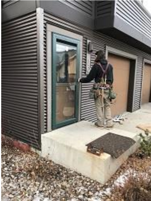
Building E1 Unit 10 Storm Door Installed