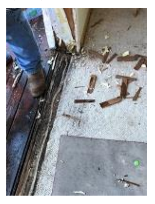
Building E7 Unit 52 Deck Door Threshold Damage