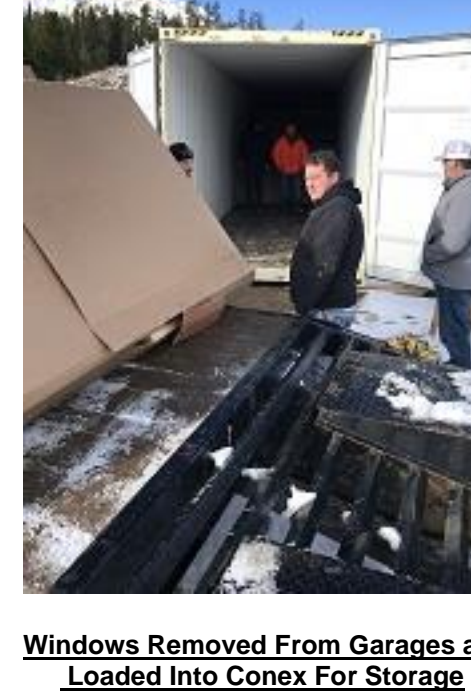
Windows Removed From Garages and