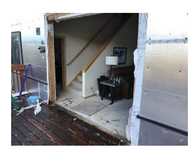
Building E7 Unit 52 Deck Door Installation