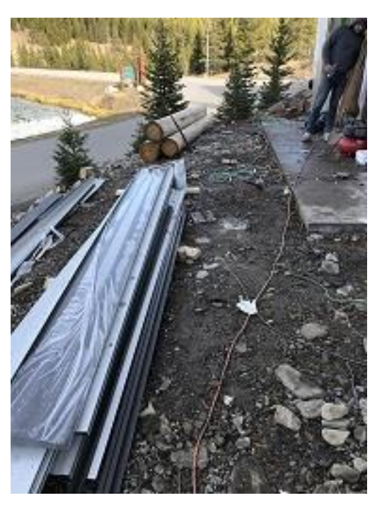
Building F2 Unit 18 Deck Knife Plates Installation