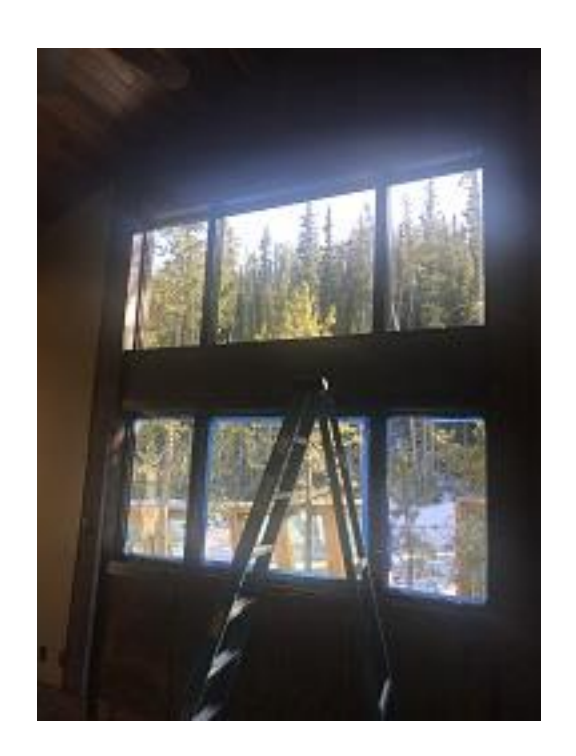
Building E3 Unit 27 Living Room Trim Installed and Finished