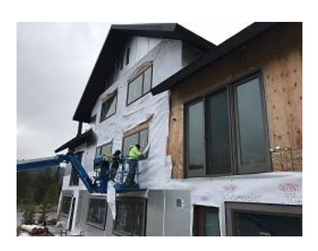
Building F2 Units 18 & 19 Back Windows Installation