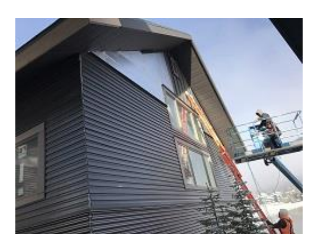
Building F2 Unit 18 Side Board and Batten Installation