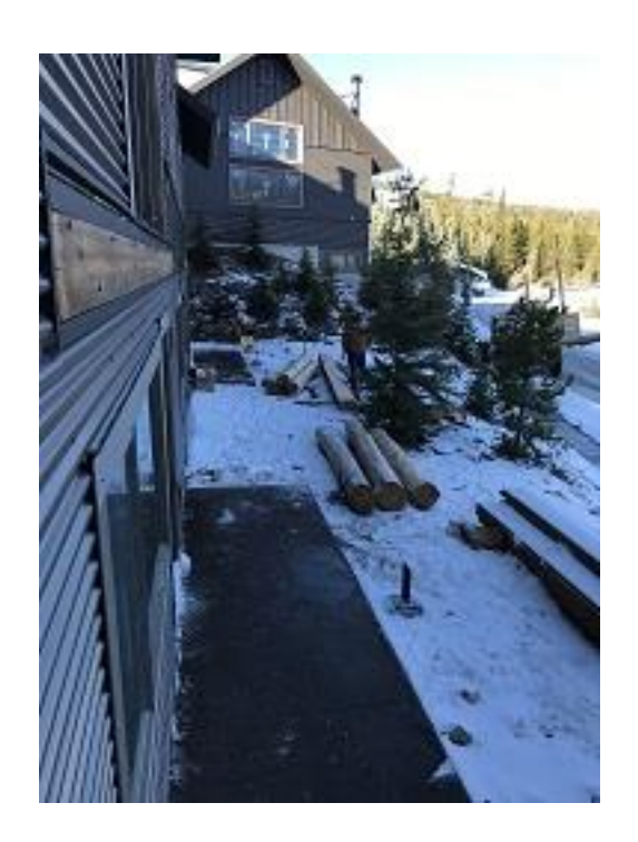
Building F1 & F2 Units 16 - 19 Deck GLULAM's Painted