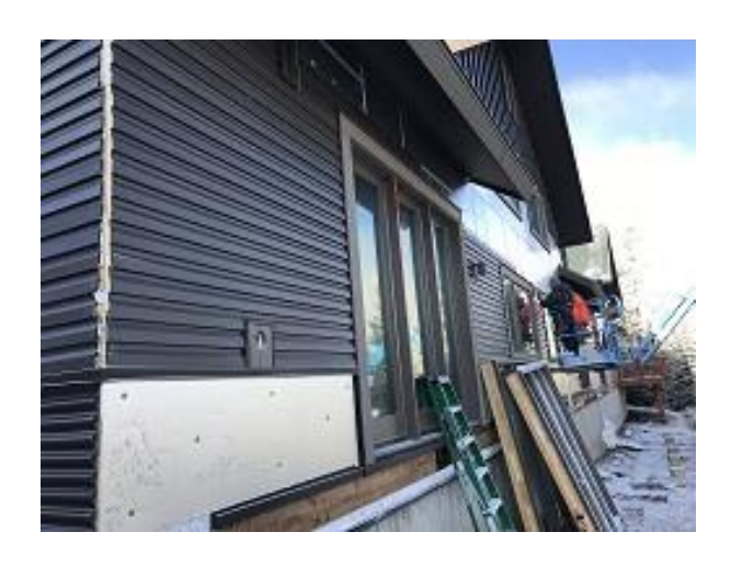
Building E7 Unit 49 Back Lap Siding Install