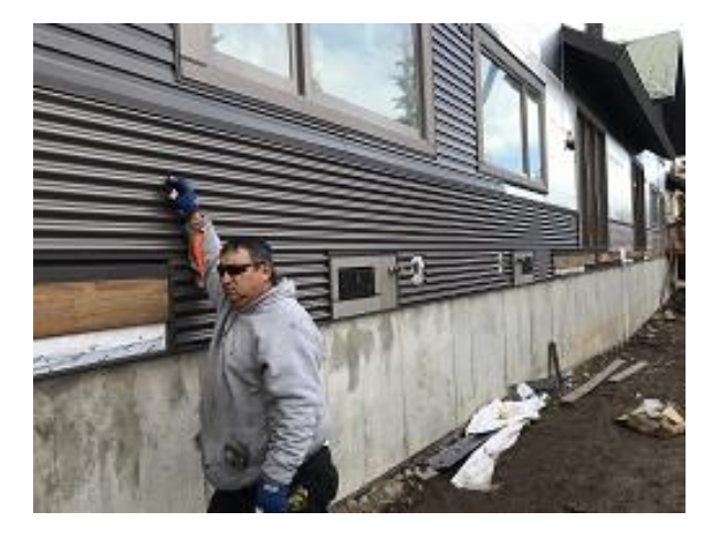
Building E7 Units 49 & 50 Back Corrugated Siding Installation