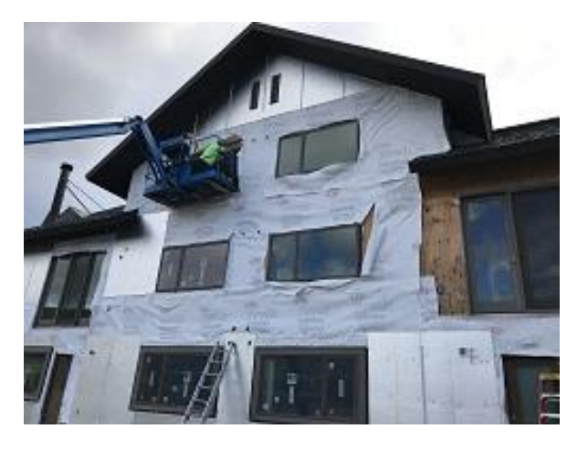
Building F2 Unit 18 Back Upper Window Install