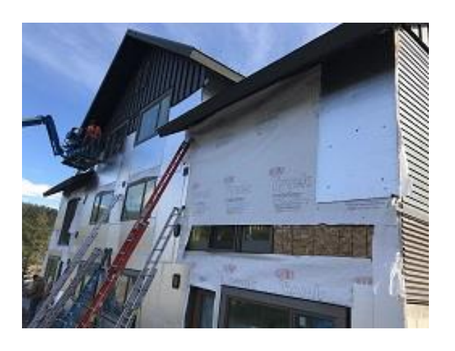
Building F2 Units 18 & 19 Back Board and Batten Siding Installation