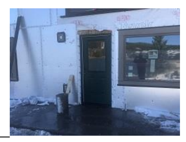
Building F2 Unit 18 Back Lower Door Installed