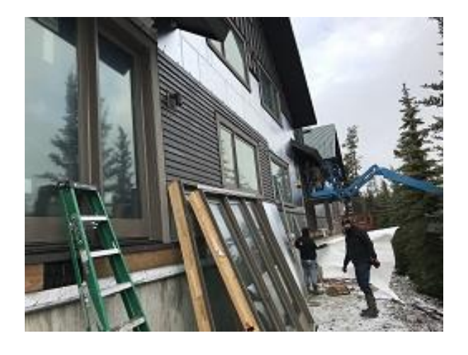
Building E7 Units 49 & 50 Back Lap Siding Installation