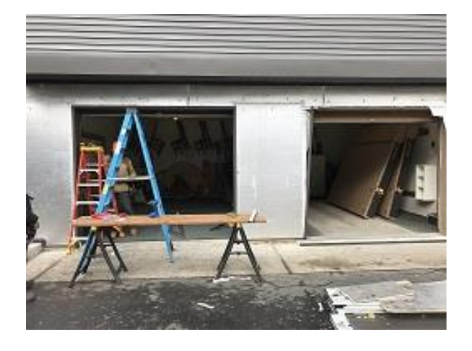
Building F2 Units 18 & 19 Garage Door Flashing Installation