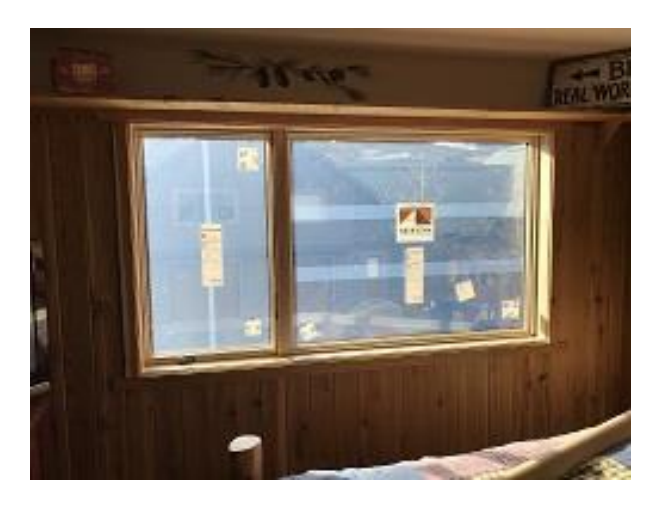
Building E3 Unit 27 Front Upper Interior Trim Installation and Finishing