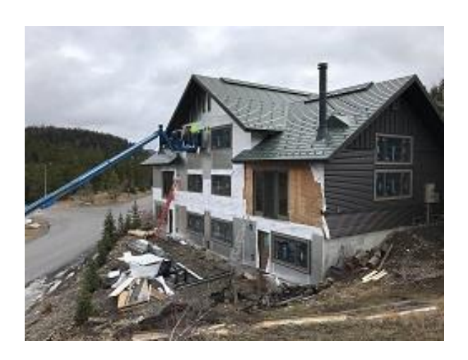
Building F2 Units 18 & 19 Back Window Trim Installation