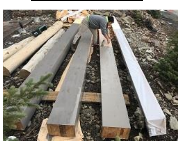
Building F1 & F2 Units 16 - 19 Deck GLULAM's Painted