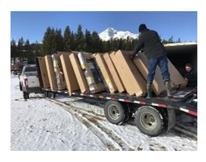
Windows Removed From Garages and Loaded Into Conex For Storage