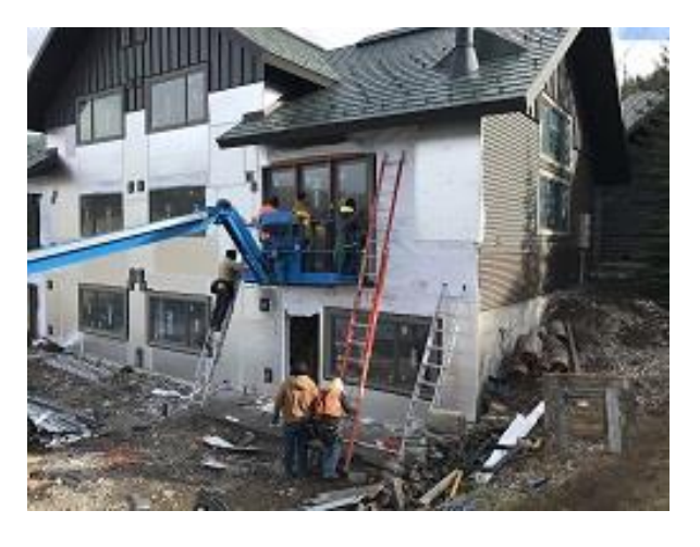
Building F2 Unit 19 Back Deck and Lower <u>Door Installation</u>