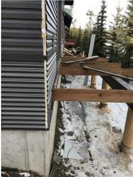
Building E7 Unit 50 Deck GLULAM Installation Preparation