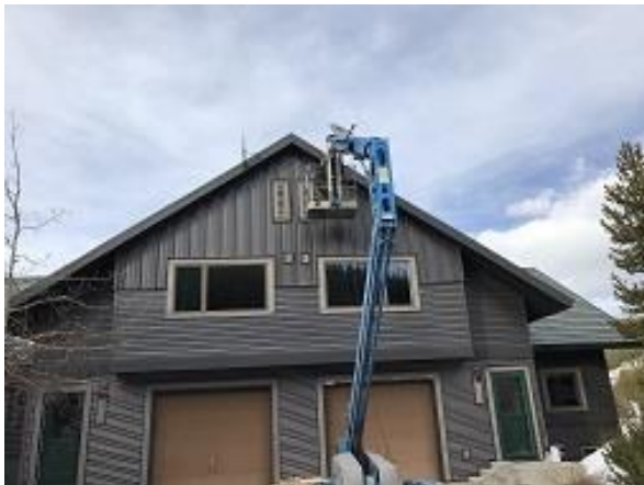
Building F2 Units 18 & 19 Satellite Installation