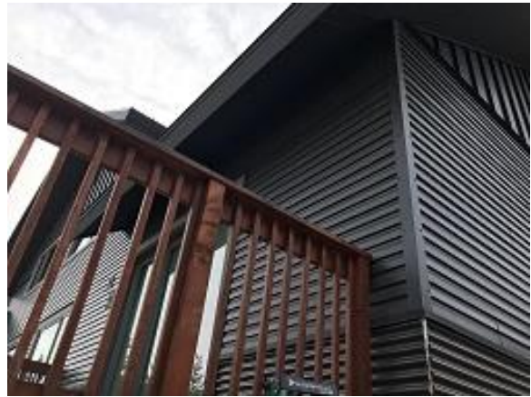
Building E7 Unit 52 Lap Siding Installed