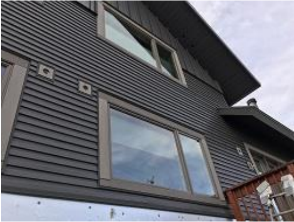
Building E7 Unit 52 Lap Siding Installed