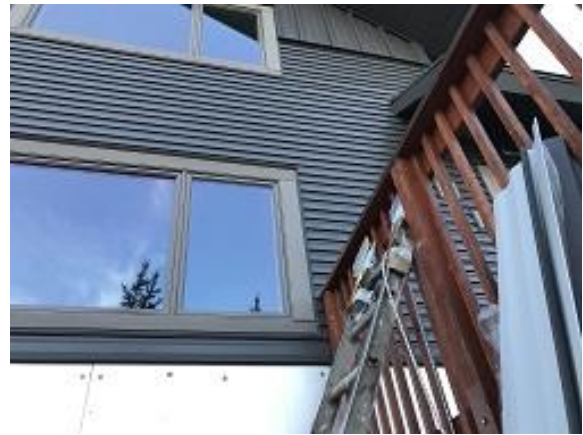
Building E7 Unit 52 Back Lap Siding Installed