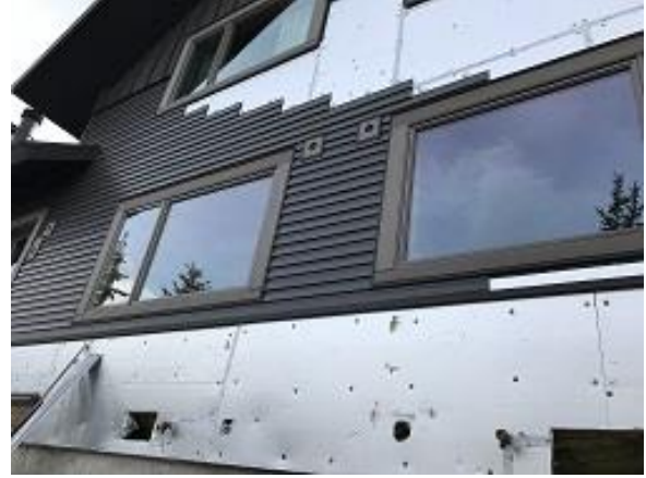
Building E7 Units 51 & 52 Back Lap Siding Installation