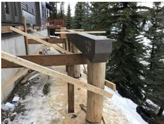
Building E7 Unit 50 Deck GLULAM Installed