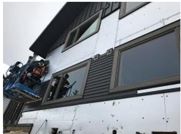
Building E7 Unit 51 Lap Siding Installation