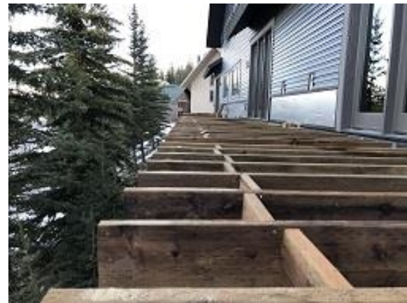
Building E7 Units 50 & 51 Deck Framing Installation