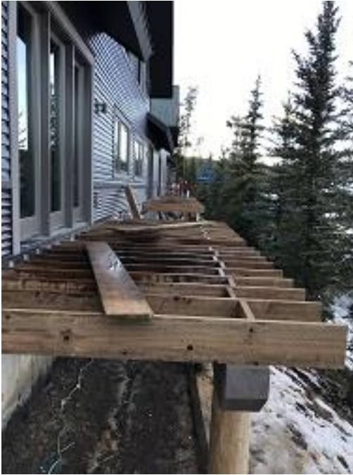
Building E7 Units 49 - 51 Deck Framing Installation