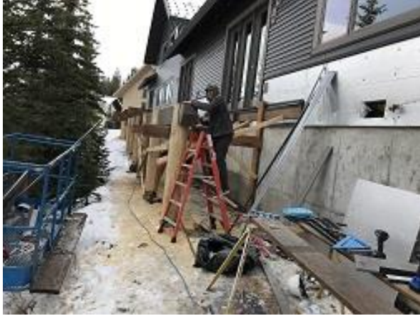
Building E7 Unit 51 Deck GLULAM Installed