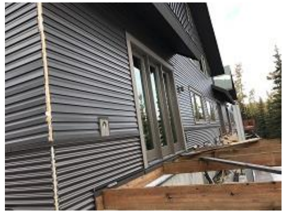
Building E7 Unit 50 Back Lap Siding Installed