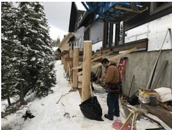
Building E7 Unit 51 Deck Log Posts Installed