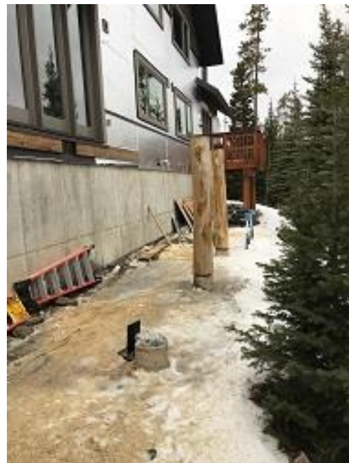
Building E7 Unit 51 Deck Log Posts Install Began