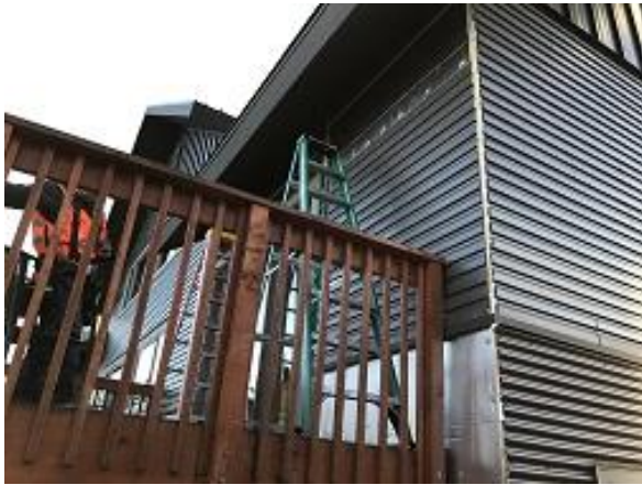
Building E7 Unit 52 Back Lap Siding Installed