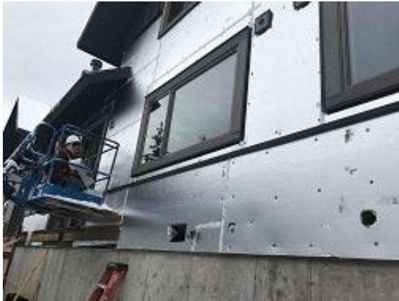
Building E7 Unit 51 J Channel & Blocking Installation