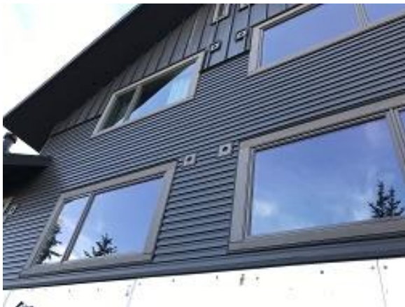
Building E7 Units 51 & 52 Back Lap Siding Installed