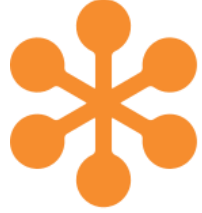
April Board Meeting ( GoToMeeting link )