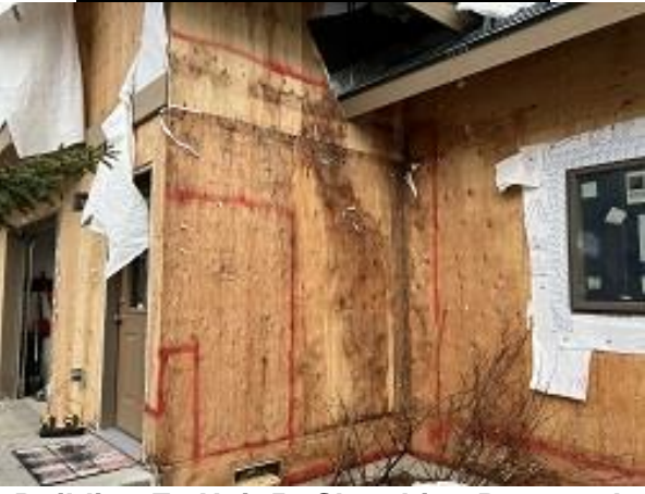
Building E8 Unit 57 Sheathing Removed with Moisture Higher Than 10%