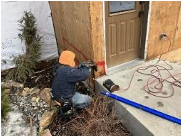
Building E8 Unit 58 Sheathing Removed with Moisture Higher Than 10%