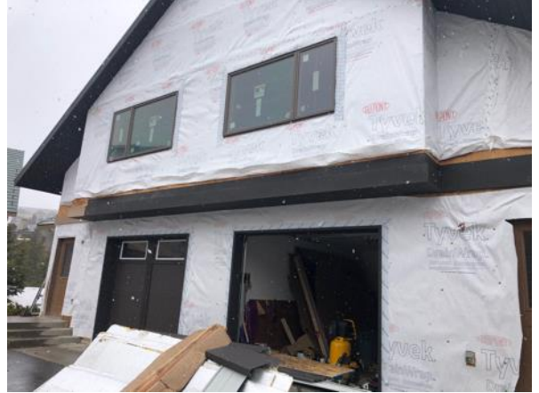
Building E8 Unit 58 & 57 Belly Band