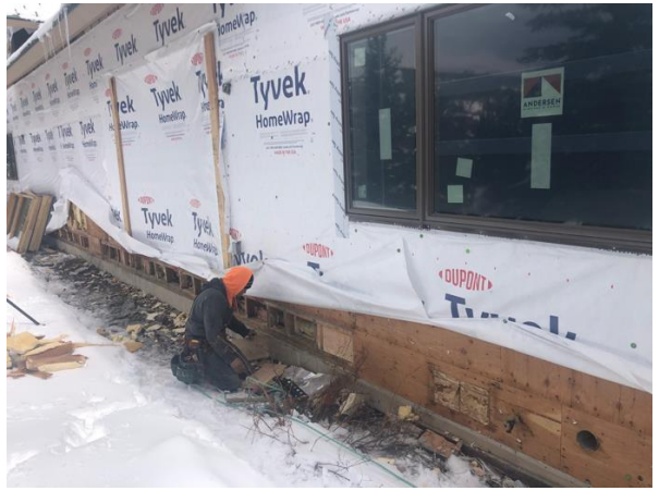
Building E8 Unit #57 Blocking in Progress