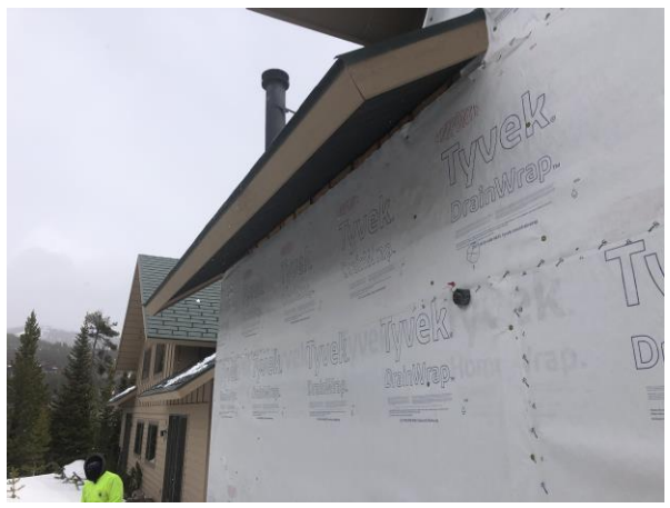
Building E8 Unit 55 Rear Soffit