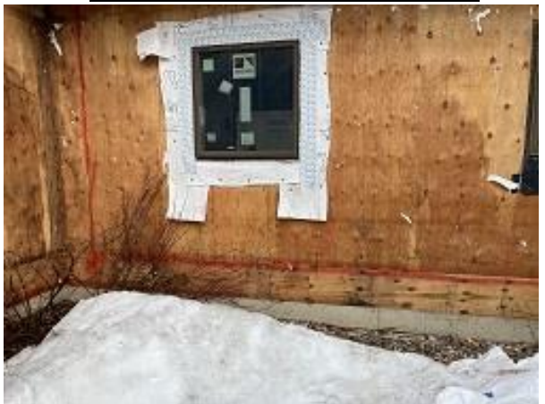
Building E8 Unit 57 Front Sheathing Removed with Moisture Higher Than 10%