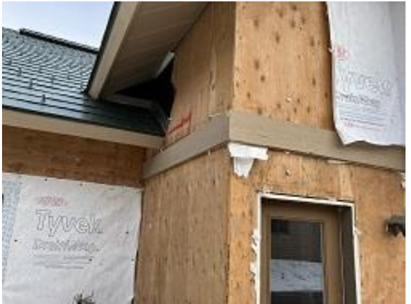
Building E8 Unit 58 Sheathing Removed with Moisture Higher Than 10%