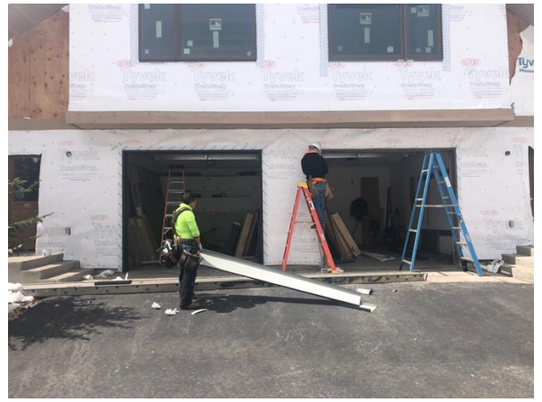
Building E8 Units 55 & 56 Garage Door Trim