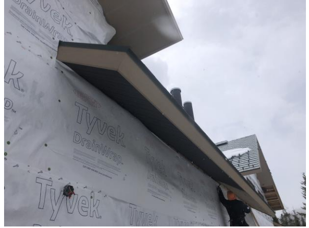
Building E8 Unit 56 & 57 Rear Soffit