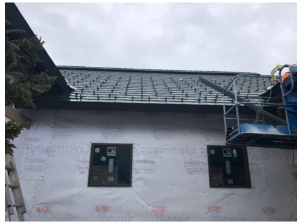
Building E8 Units 57 & 56 Kitchen Windows