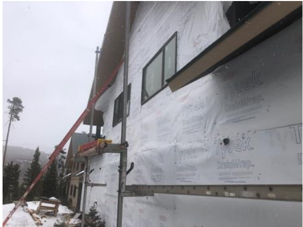
Building E8 Unit 55 Drain Wrap