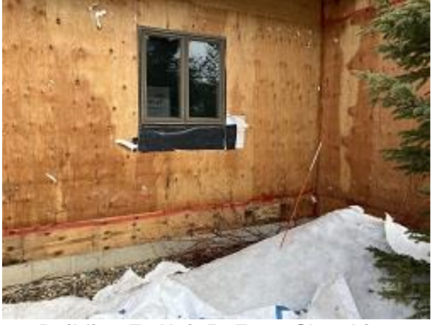
Building E8 Unit 56 Front Sheathing Removed with Moisture Higher Than 10%