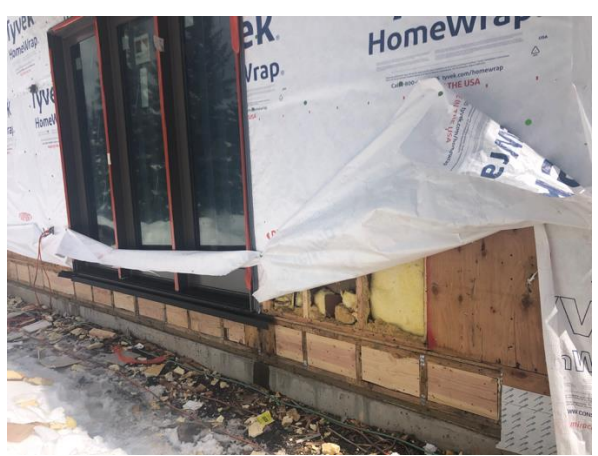
Building E8 Unit #58 Blocking at Deck