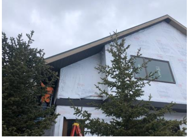
Building E8 Unit #56 Belle Band