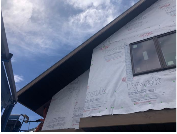
Building E8 Unit #58 Soffit in Progress