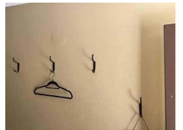
Building C1 Unit 12 Front Substate Repair Caused Interior Damage