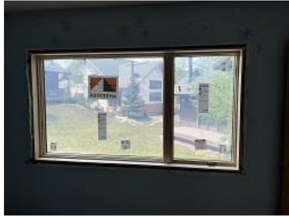
Building C1 Unit 12 Back Lower Window Installed