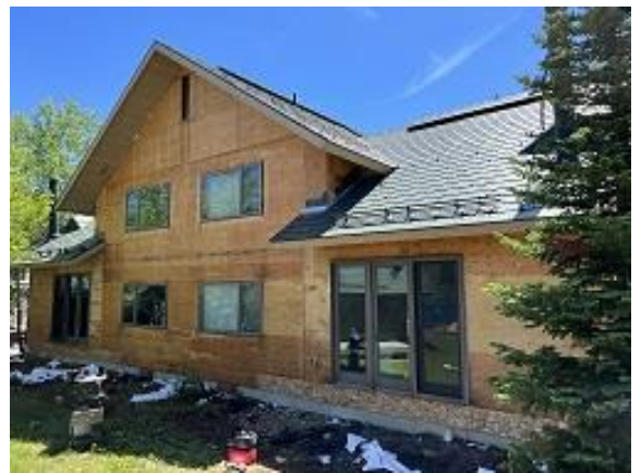
Building C1 Units 12 & 13 Back Sheathing Exposed & Deck Sheathing Installed