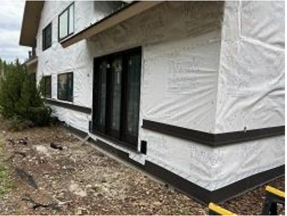
Building C8 Units 65 & 66 Back Base & Wainscot Flashing and Deck Door Installed