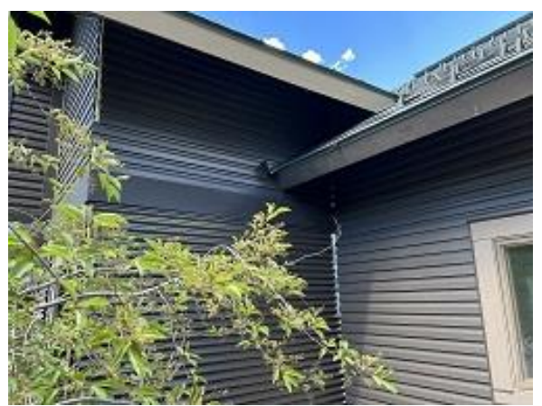
Building E5 Unit 41 Front Diverter and Lap Siding Installed