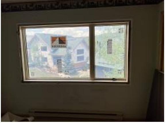
Building C1 Unit 12 Back Upper Window Installed