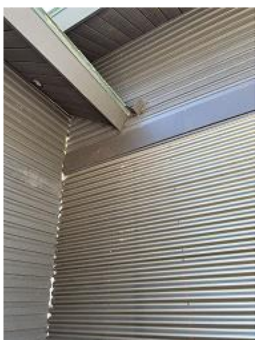
Building E5 Unit 44 Front Diverter & Lap Siding Installed