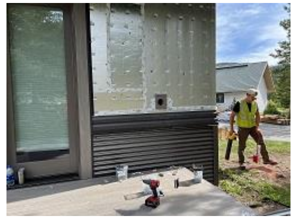
Building E1 Unit 8 Back Lap Siding Removed to Locate Fireplace Vent