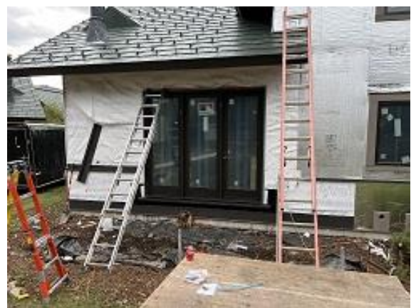
Building C5 Unit 40 Deck Door & Helical Piers Installed