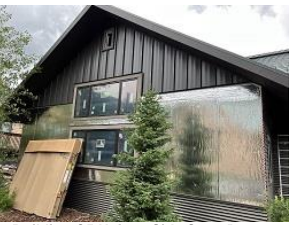
Building C5 Unit 39 Side Snap Batten Siding Installed