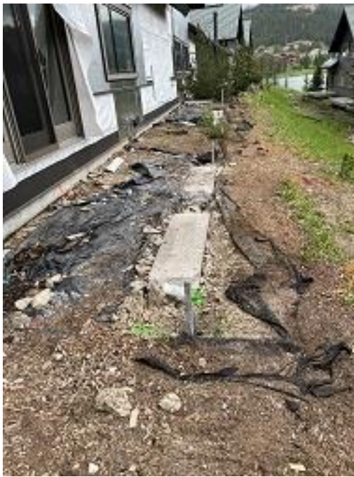
Building D Units 36 & 37 Deck Helical Piers Installed