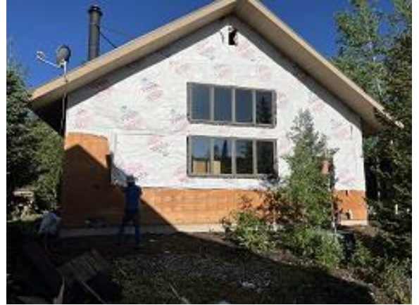
Building C2 Unit 14 Side Sheathing Exposed