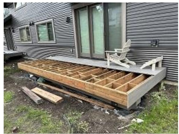
Building E2 Unit 23 Decking Removed for Railing Installation