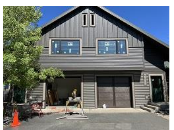
Building D Units 37 & 38 Front Corners Installed