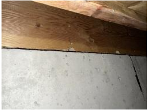
Building C1 Unit 12 Deck Ledger Blocking Installed in Crawl Space