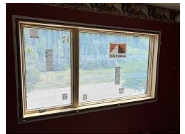
Building C1 Unit 12 Front Upper Window Installed