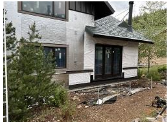
Building C5 Unit 39 Deck Door & Helical Piers Installed