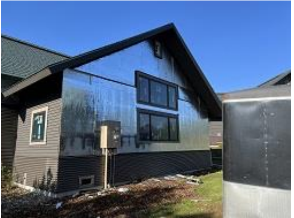
Building C5 Units 40 Snap Batten Flashing, Insulation, Window Trim & J Channel Installed