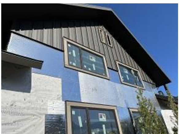
Building D Units 37 & 38 Back Snap Batten Siding Installed