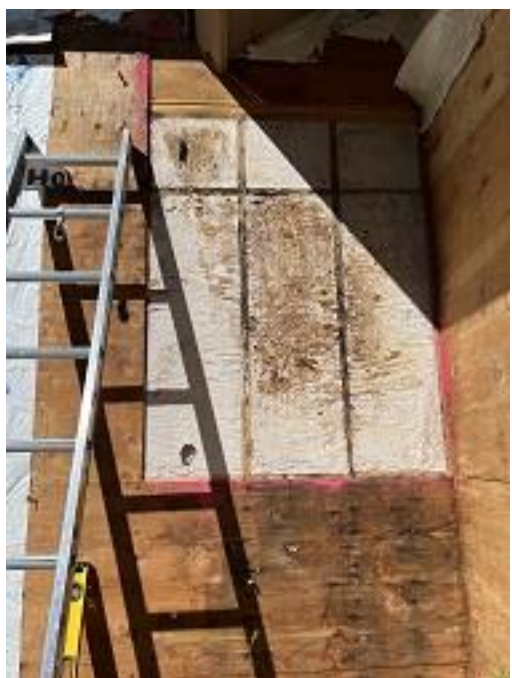
Building C1 Unit 12 Front Substrate Damage