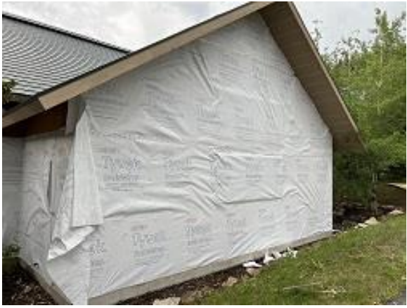
Building C2 Unit 15 Side Tyvek Installed