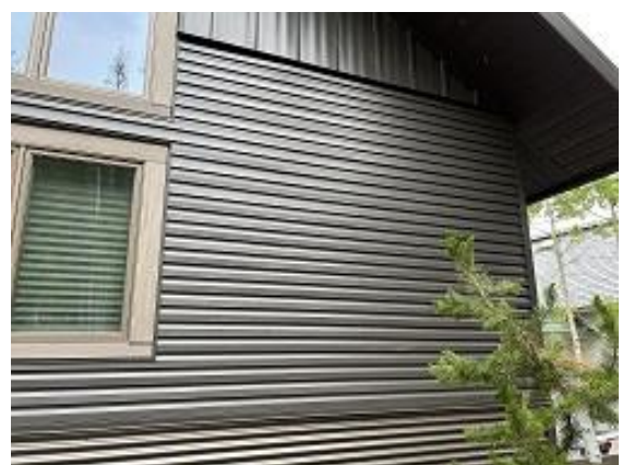
Building E3 Units 27 Side Wire Penetration Repaired