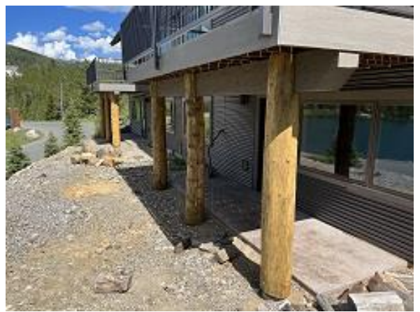
Building F2 Units 18 & 19 Deck Posts Stained