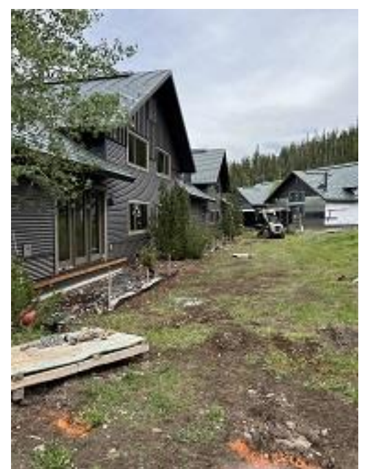
Building E6 Units 45 - 48 Deck Helical Piers Installed