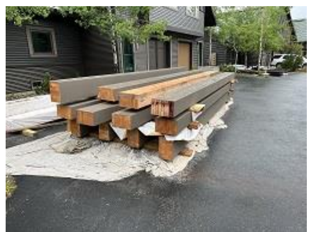
Deck GLULAM Painting Continued