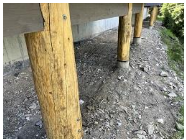
Building E7 Units 49 - 51 Deck Posts Stained