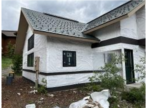
Building C8 Unit 66 Front & Side Base & Wainscot Flashing Installed