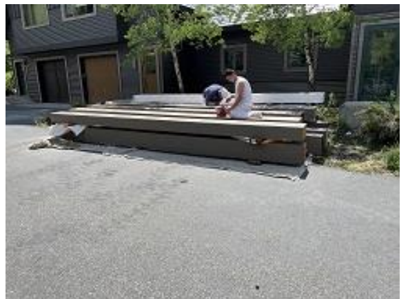
Deck GLULAMs Painting Continued