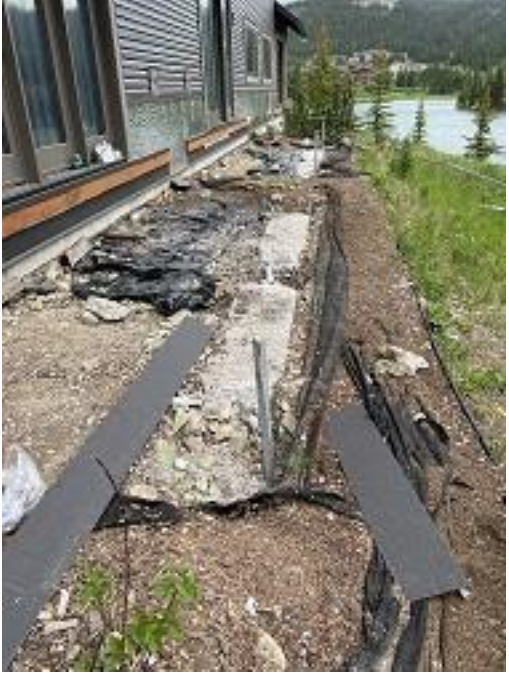
Building E5 Units 42 & 43 Deck Helical Piers Installed