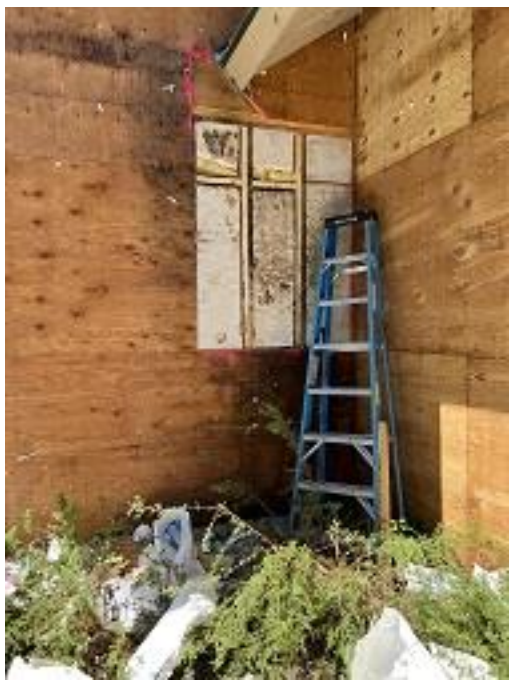
Building C1 Unit 12 Front Sheathing Exposed Substrate Repaired