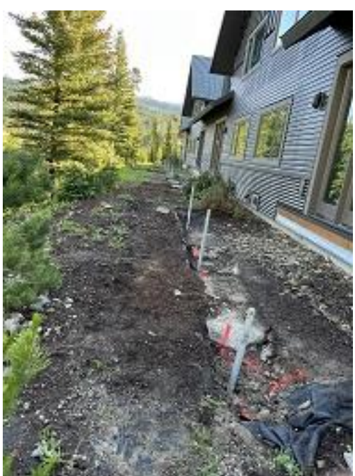
Building E8 Units 55 - 58 Deck Helical Piers Installed