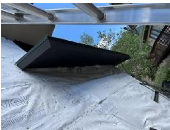
Building C5 Unit 39 Back Soffit & Fascia Installed