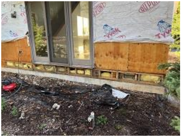
Building C2 Unit 14 Deck Ledger Sheathing Removed