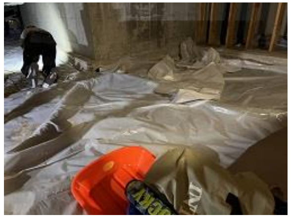
Building A Unit 2 Crawlspace Radon Remediation Damage Vapor Barrier Removed and Reinstalled