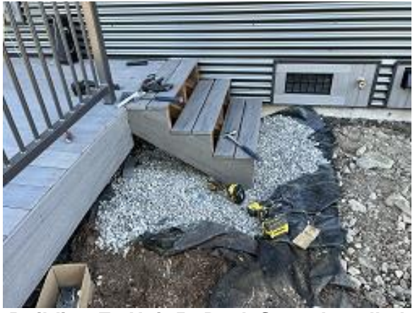
Building E8 Unit 57 Deck Steps Installed