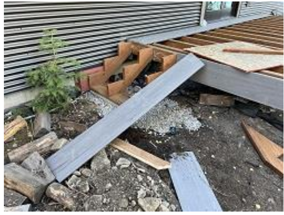
Building B Unit 6 Deck Stairs Installed