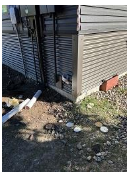
Building A Units 1 & 2 Radon Exhaust Installed