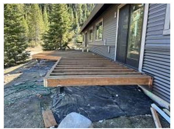
Building A Units 1 & 2 Deck Framing Completed