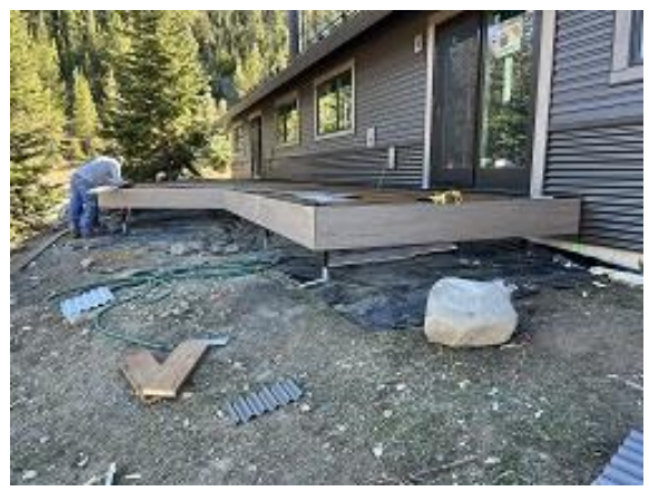
Building A Unit 2 Deck Fascia Installed