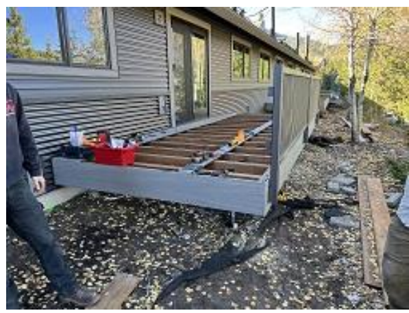
Building B Unit 4 Deck Railing Installed