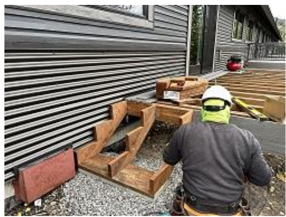
Building B Unit 3 Deck Stairs Installed