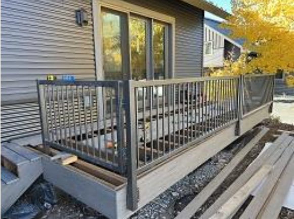
Building E9 Unit 61 Deck Railing Installed