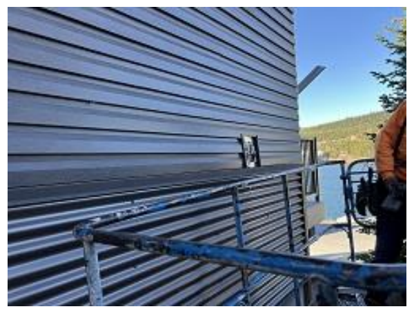
Building F1 Unit 16 Side Fireplace Vent Blocking Installed