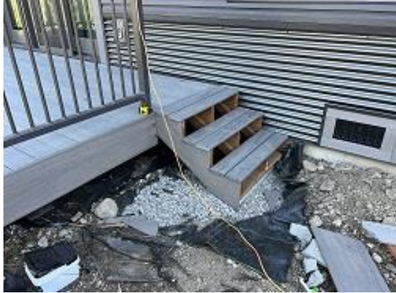
Building E8 Unit 55 Deck Steps Installed