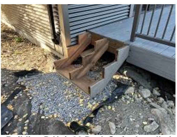
Building D Unit 36 Deck Stairs Installed