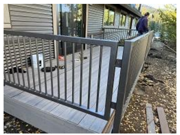
Building B Unit 5 Decking Installed