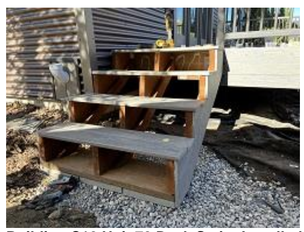
Building C10 Unit 70 Deck Stairs Installed