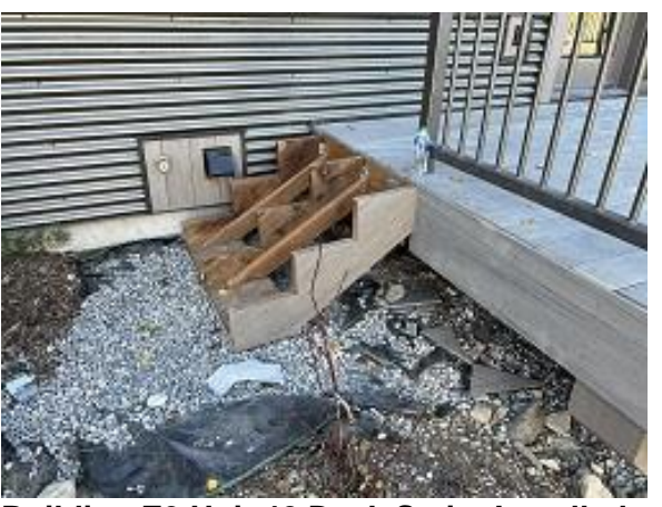
Building E9 Unit 42 Deck Stairs Installed