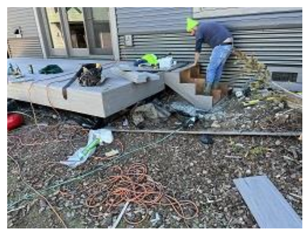
Building E9 Unit 64 Deck Stairs Installed