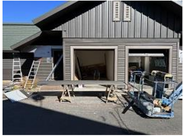
Building B Units 3 & 4 Front Corrugated Siding Installed