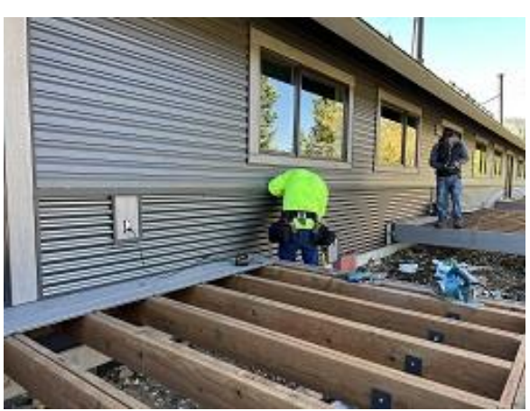
Building B Units 3 & 4 Back Corrugated Siding Installed