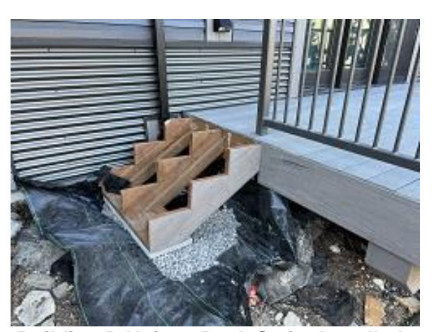
Building D Unit 37 Deck Stairs Installed