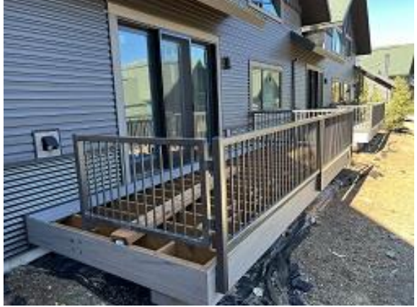
Building D Unit 36 Deck Railing Installed