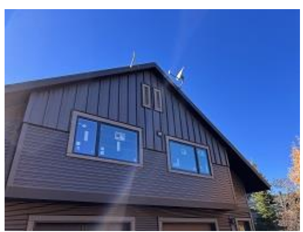
Building C4 Units 34 & 35 Satellite Dishes Installed