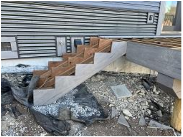
Building E5 Unit 44 Deck Stairs Installed