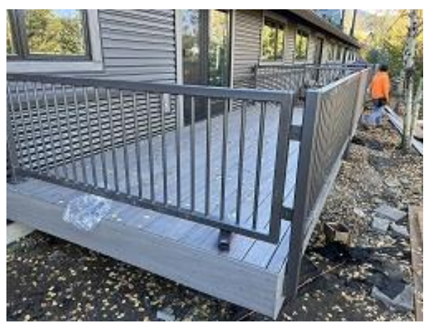
Building B Unit 4 Decking Installed