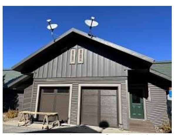
Building B Units 3 & 4 Satellite Dish Installed