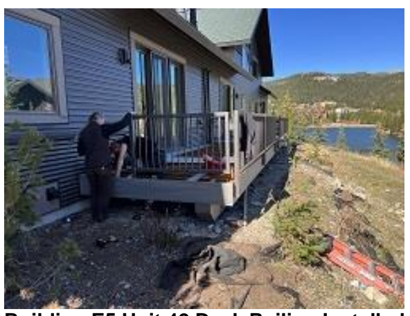
Building E5 Unit 42 Deck Railing Installed