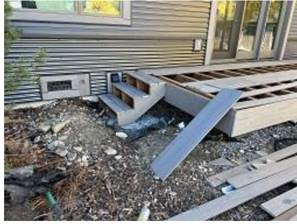
Building E9 Unit 61 Deck Steps Installed