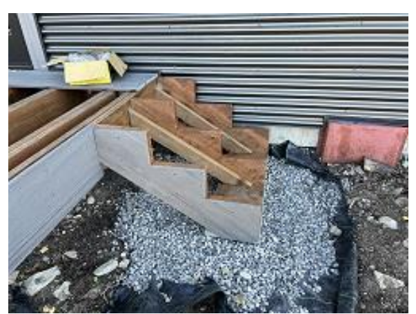
Building B Unit 7 Deck Stairs Installed