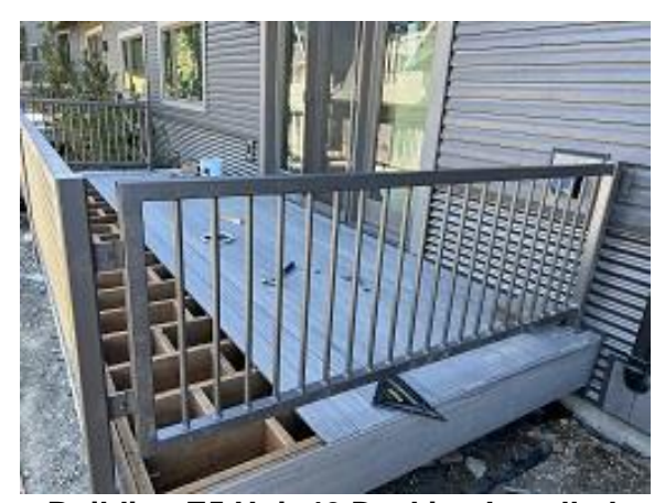
Building E5 Unit 42 Decking Installed