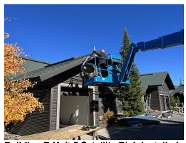
Building B Unit 5 Satellite Dish Installed